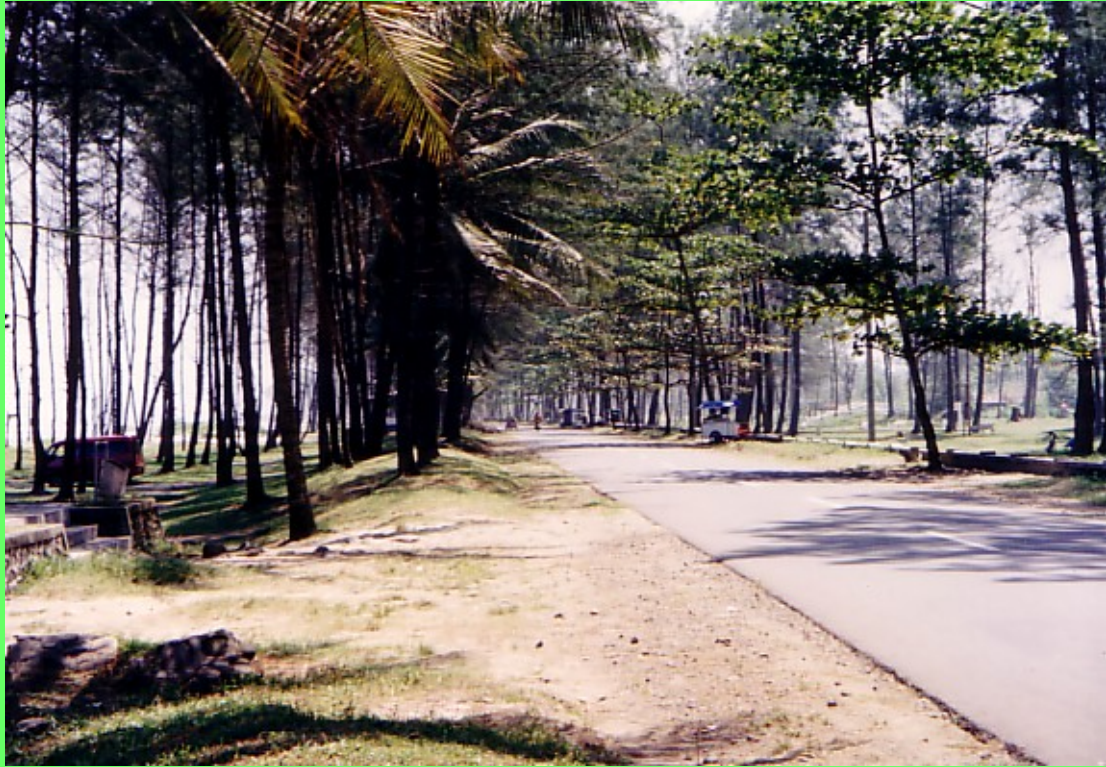
P.6 The esplanade of Bengkulu in 1998