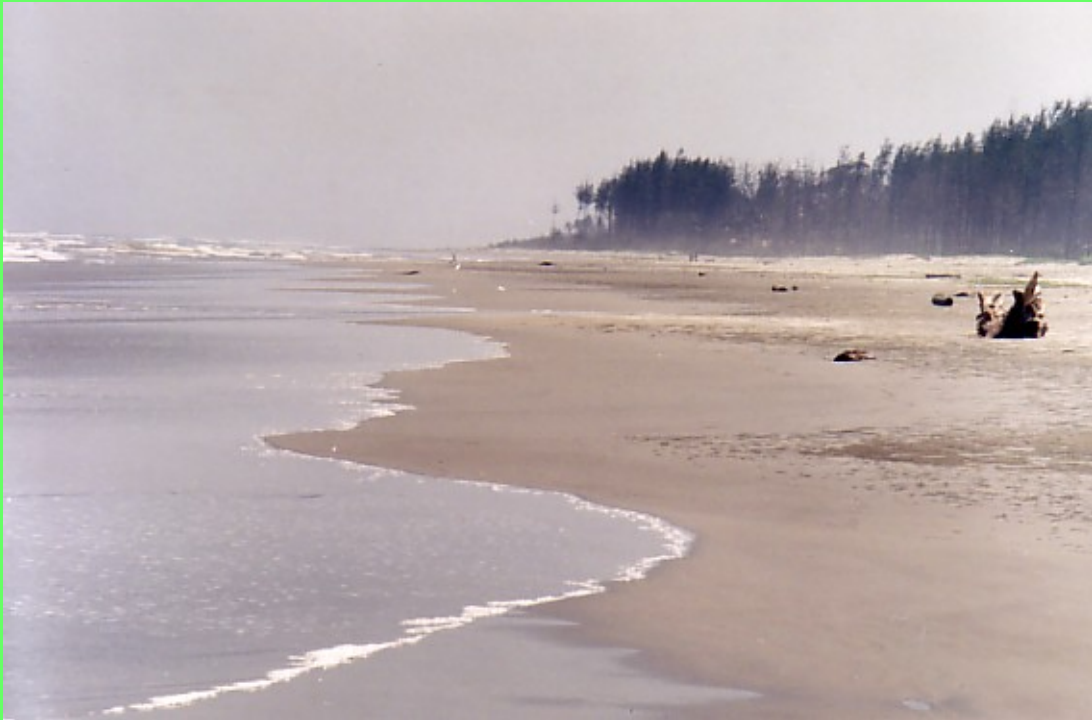
P.4 Not Treasure Island, but the beach of Bengkulu on a busy day in 1998

My wife and I have been spending there a couple of days. We were the only guests of the hotel and we enjoyed a wonderful time. During the afternoon locals joined us at the swimming pool for a swim, a dive and a chat. We felt lost at the pantai-(beach-)esplanade, but a lovely lady, her beautiful baby as well as the refreshments (P.5)made us feel very comfortable.