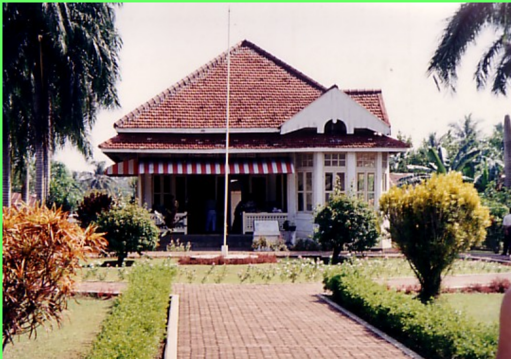
P.9 Exile in luxury, Sukarno's beautiful Dutch colonial villa, Bengkulu 1998

The first president of Indonesia was brought into exile by the Dutch from 1938 until the arrival of the Japanese in 1942. The Dutch allowed him to spend his time in a luxury villa in Bengkulu. He was not allowed to leave Bengkulu and vicinity, but otherwise Sukarno could do whatever he liked to do.