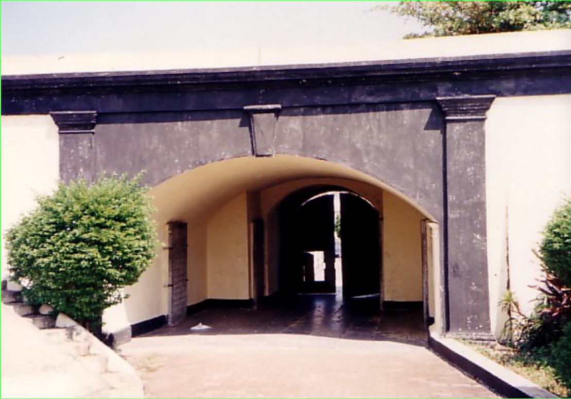
P. 13 The second, northern gate from the inside, Bengkulu 1998