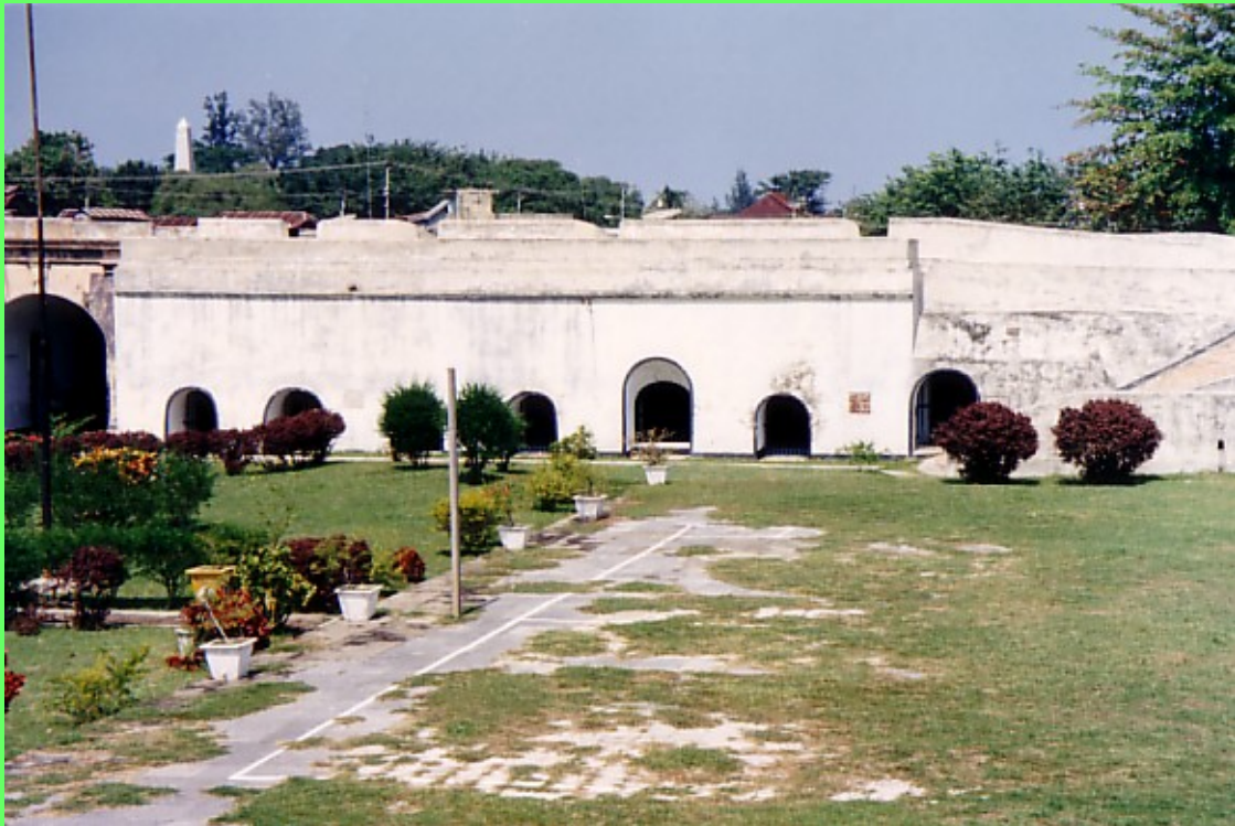
P.16 The inner court, the main gate at the left, Bengkulu 1998