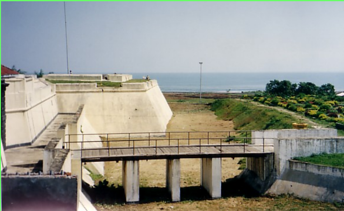
P.14 The northern gate and a part of the ramparts, Bengkulu 1998