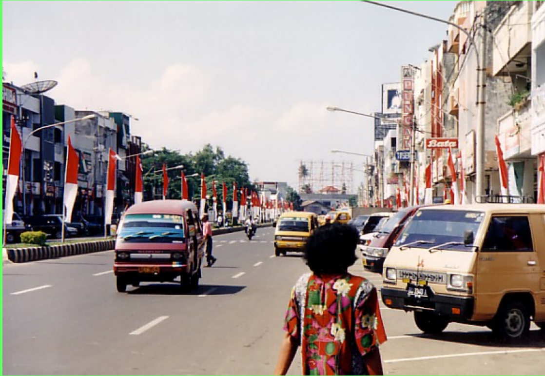
P.19 Modern Bengkulu in 1998