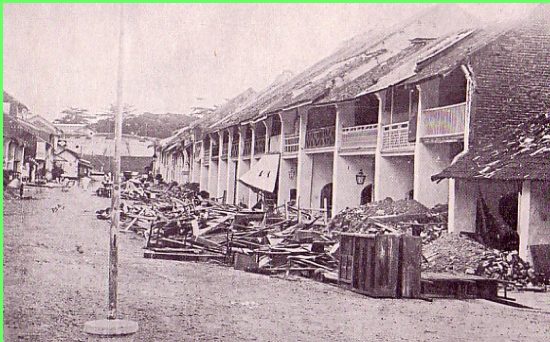
P.7 The Chinese Quarter of Bengkulu / Benkoelen after the earthquake of 1916 From: Indië, geïllustreerd Weekblad voor Nederland en Koloniën: jrg. 2 april 1918 – april 1919; Haarlem Holland 1918 p. 652

Earthquakes could happen around Bengkulu / Bengkulu sometimes, such as the following photographs from the olden days will show.