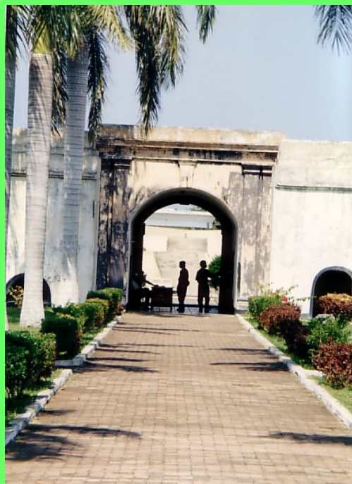
P. 11 and 12 The main gate (see p.1 also)from the outside and from the inside of Benteng Marlborough in 1998