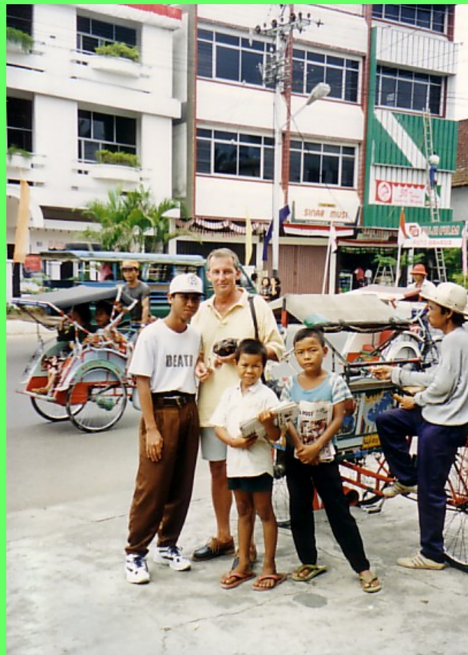
P.20 Author and fans