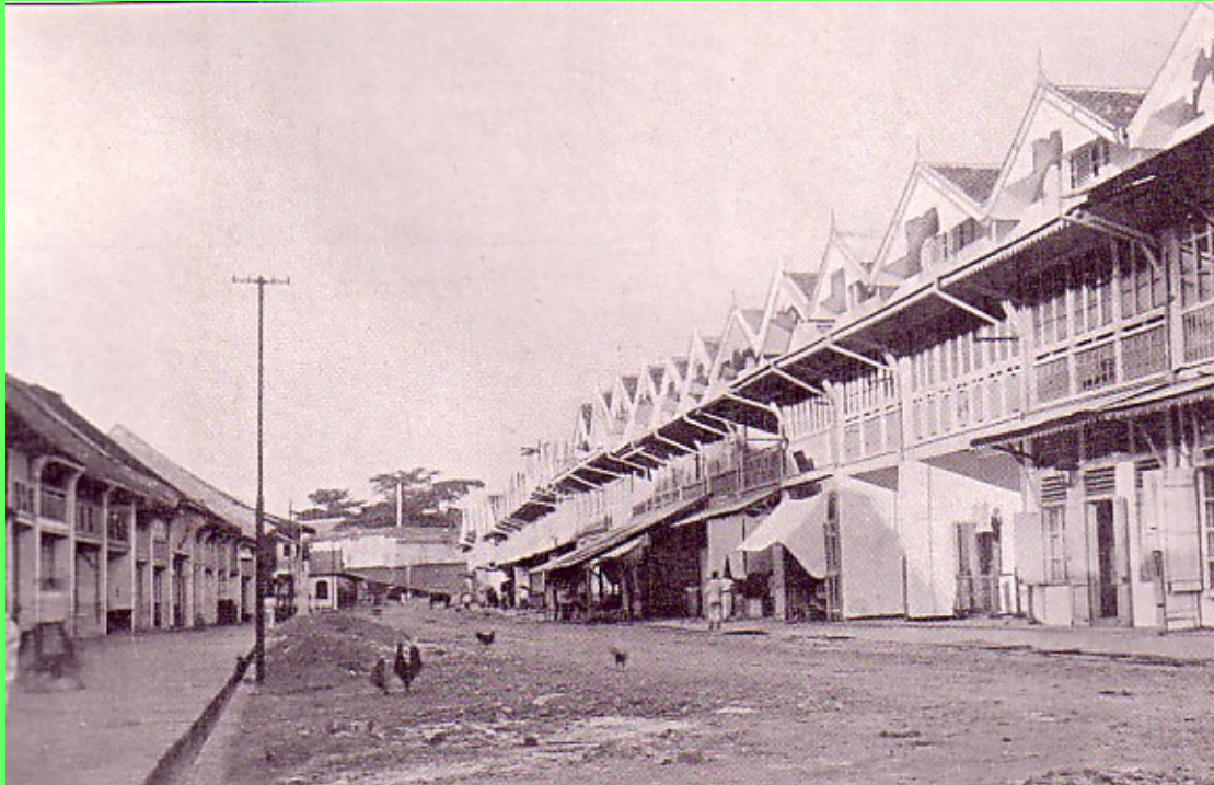
P.8 The Chinese Quarter at Bengkulu, 1918, after reconstruction