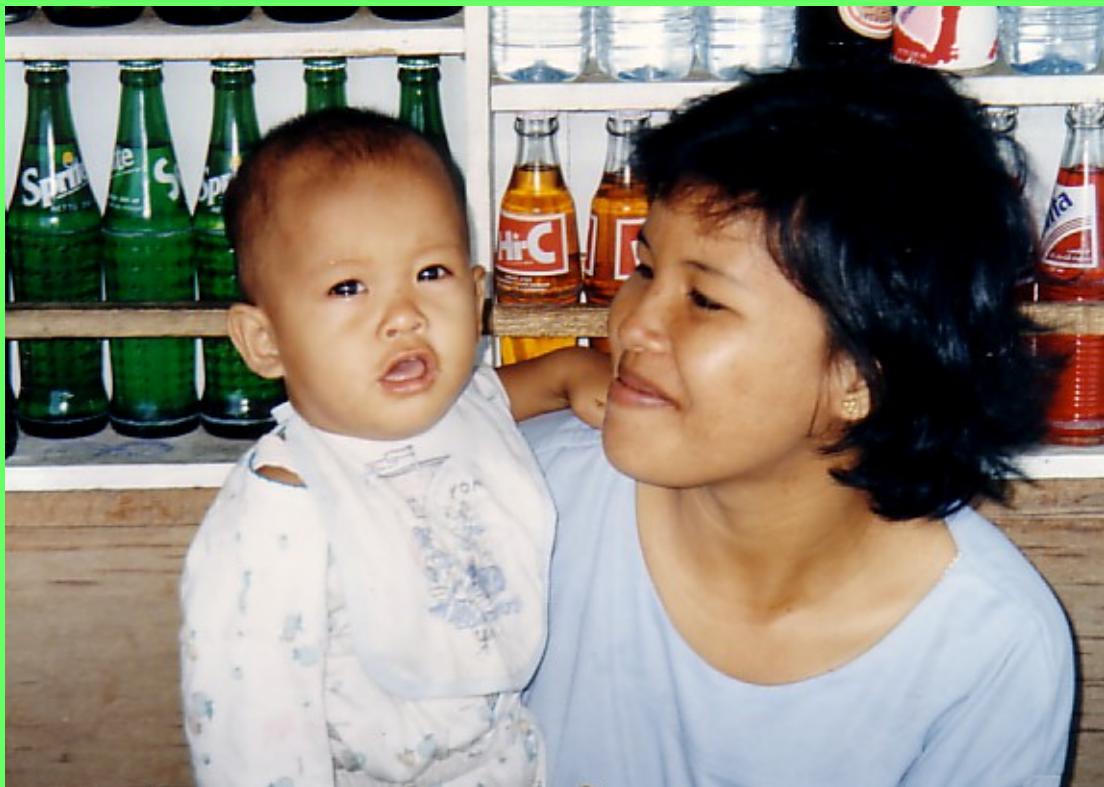
P.5 Pantai / beach of Bengkulu, 1998, a beautiful mother and a beautiful baby of course