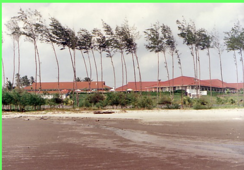
P.3 A stormy day at the beach, Bengkulu 1998