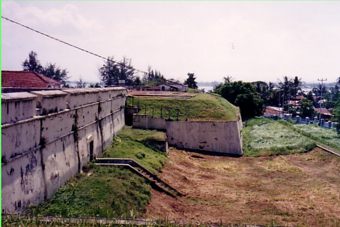
P.17 Another part of the northern ramparts, Bengkulu 1998