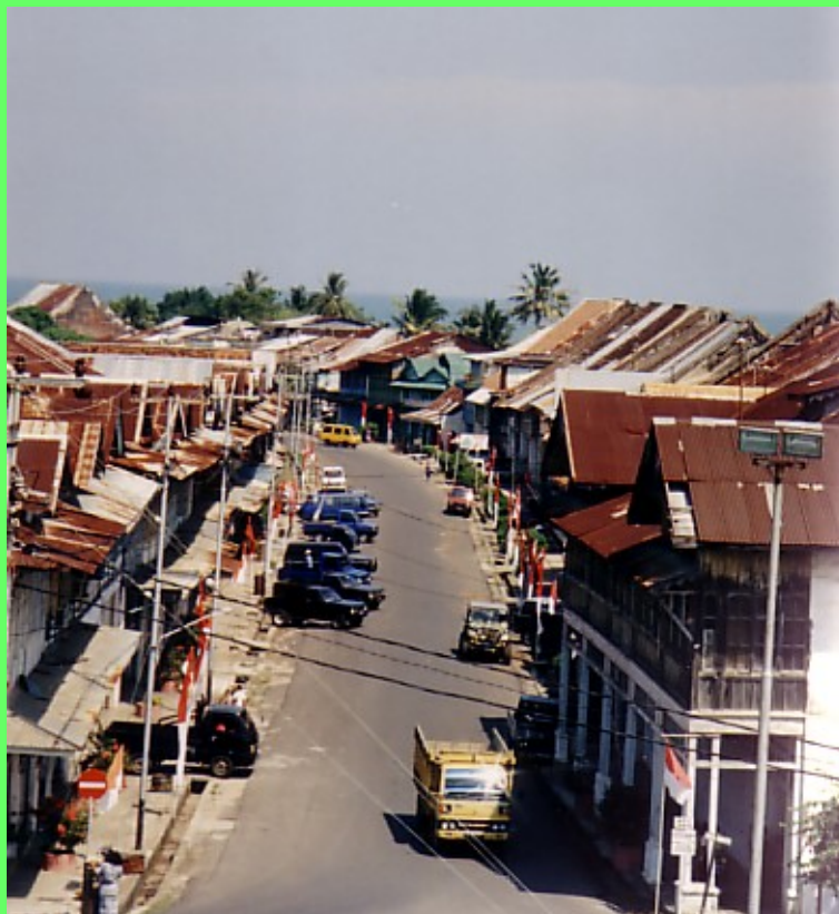
P.18 View from the fort into the old town, Benkuku 1998