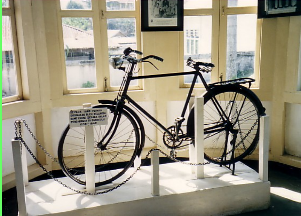
P.10 Sukarno's bicycle, made in Holland in the Gazelle Factory, Bengkulu 1998

The British founded Bengkulu in 1685. It was the last last territory in the Dutch East-Indies to be held by the British. The military centre of Bengkulu is Fort Marlborough, constructed in 1762. It is a stronghold with old English gravestones with English inscriptions. Fort Marlborough was the seat of British power in the province of Bengkulu. It replaced a fort called York and was completed in 1720. Restoration found place in 1985. The fort is open to the public.