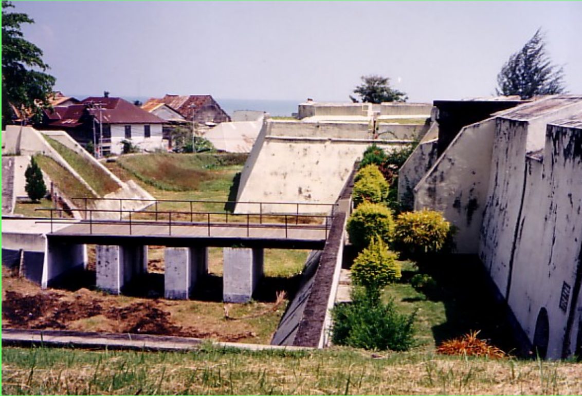
P.15 The southern main gate and another part of the ramparts, Bengkulu 1998