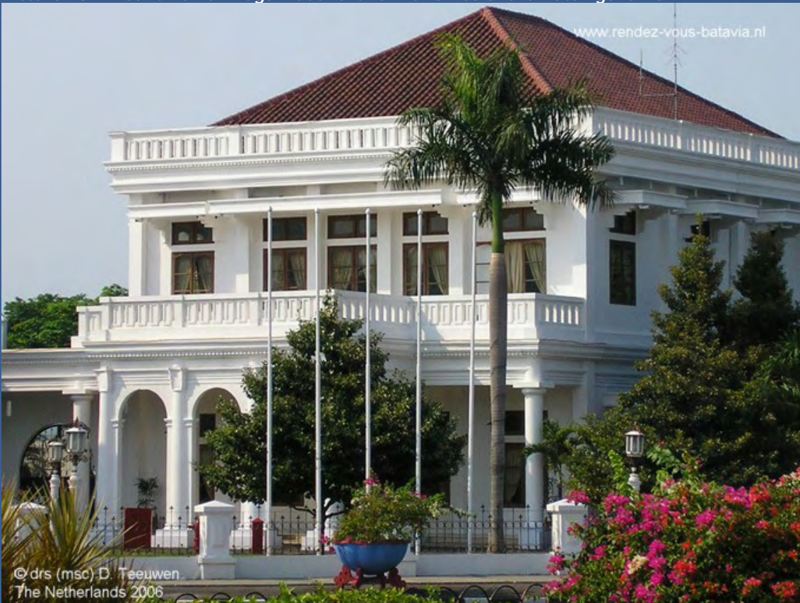
Picture 10. Around Taman Tugu Muda: the former office of the Dutch governor.