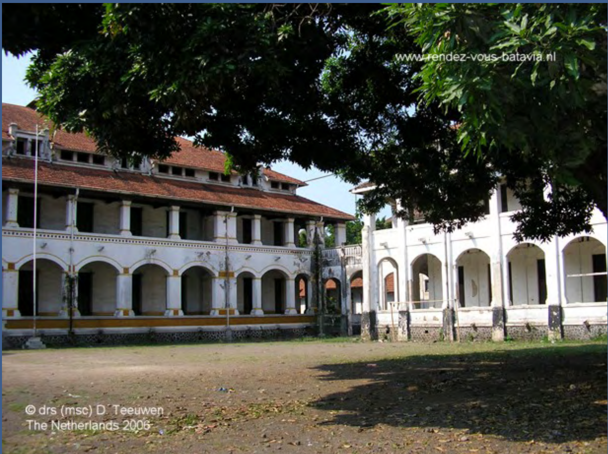
Picture 8. The inner court.