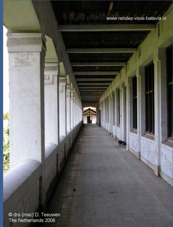
Picture 7. An impression of one of the corridors.