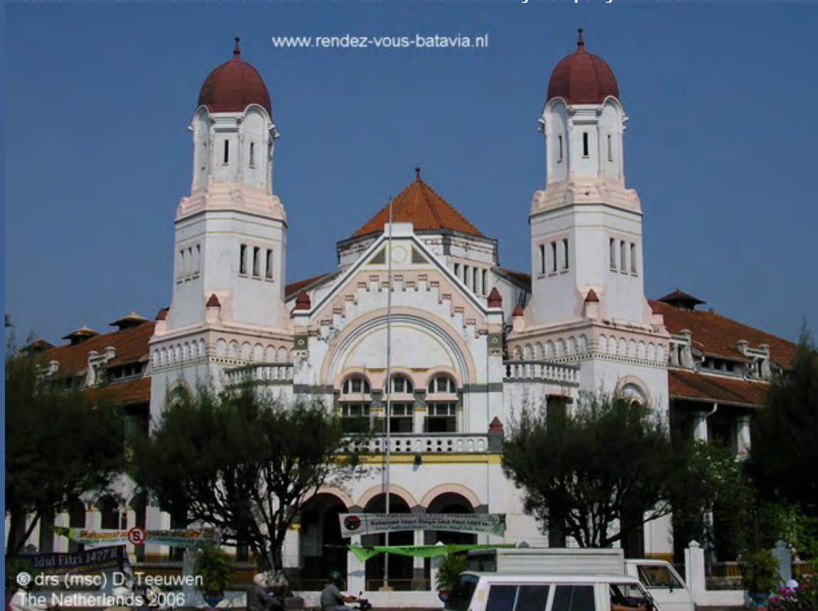
Picture 2. The former head office of the Dutch-Indian Railway Company in 2006.