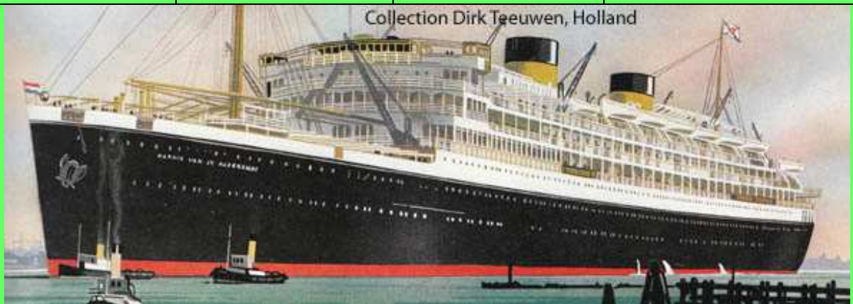
ss Marnix van St Aldegonde, Stoomvaart Maatschappij Nederland, 1936 From: The Netherlands Indies, a jubilee album; the Travellers Official Information Bureau of Netherland India, 1933