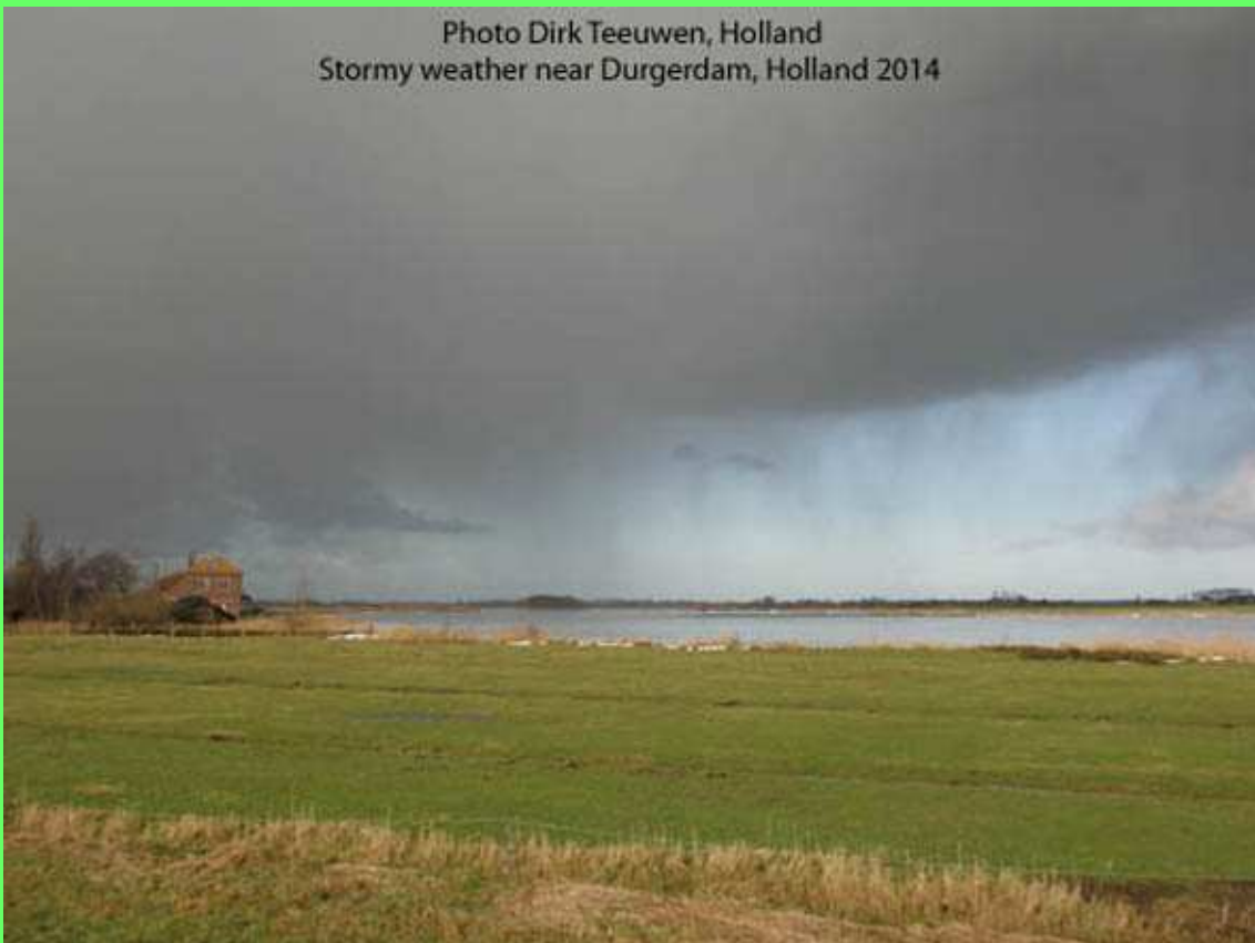
Dirk Teeuwen, Holland