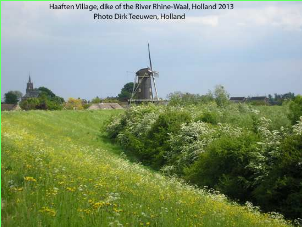
Dirk Teeuwen, Holland