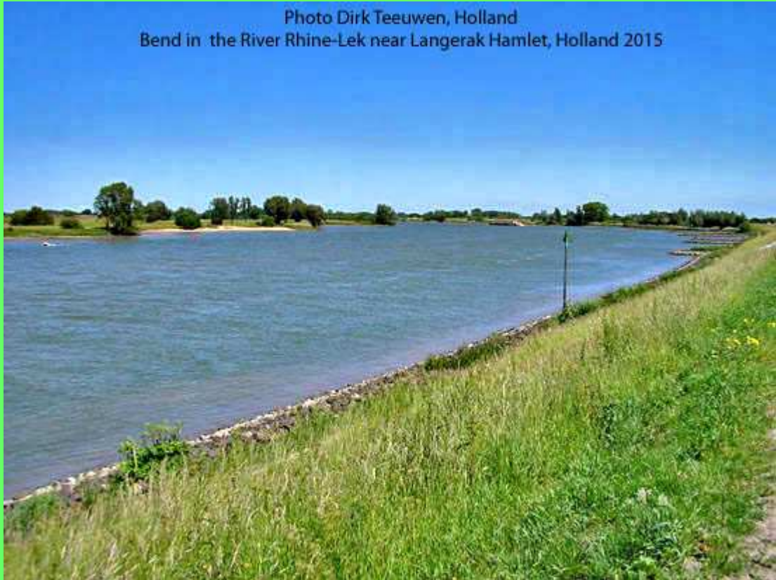
Dirk Teeuwen, Holland