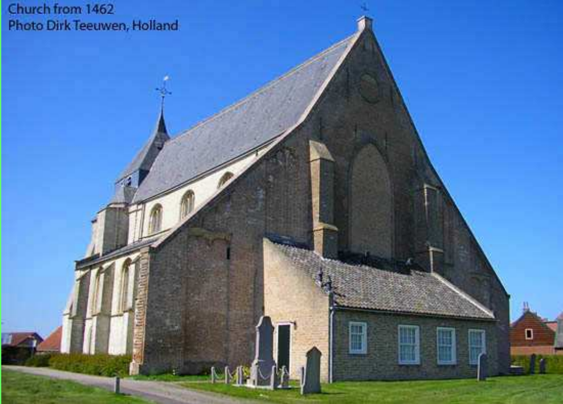
Dirk Teeuwen, Holland