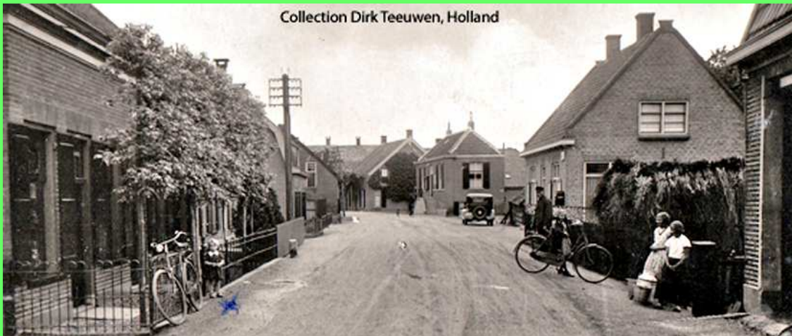
Collection Dirk Teeuwen, Holland

"Denkend aan Holland zie ik breede rivieren traag door oneindig laagland gaan, rijen ondenkbaar ijle populieren als hooge pluimen aan den einder staan; en in de geweldige ruimte verzonken de boerderijen verspreid door het land,"