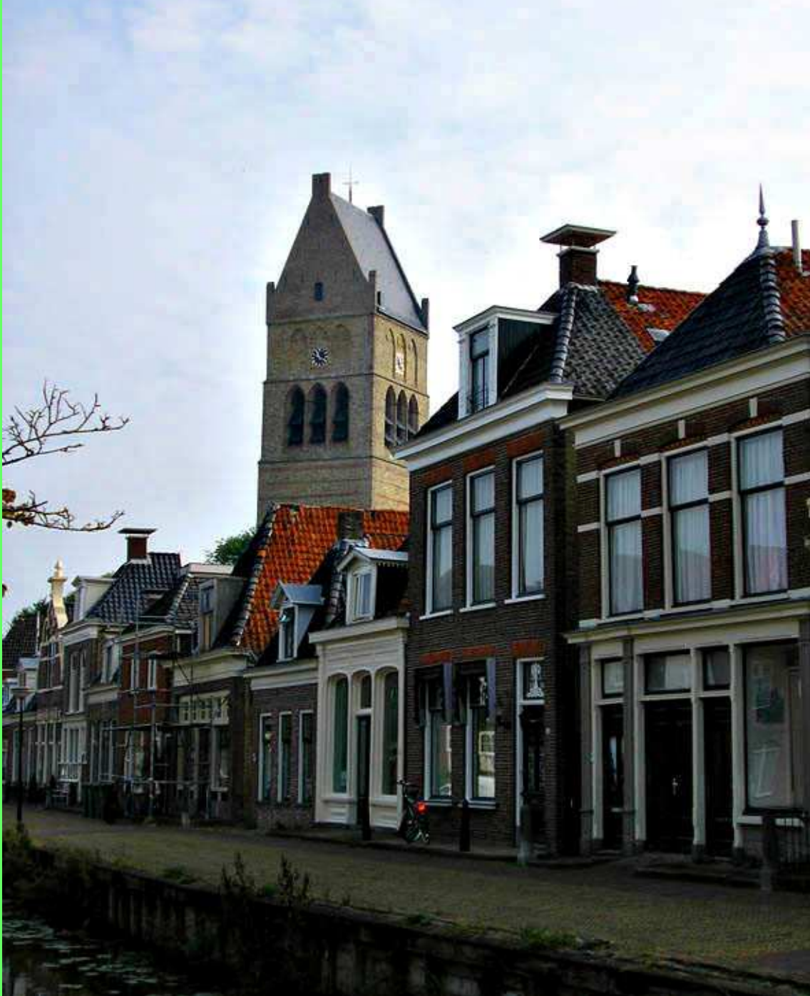
Dirk Teeuwen, Holland