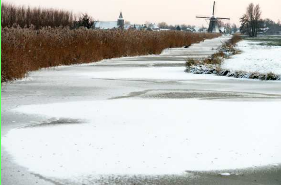
View of Zuilichem Village on River Rhine-Waal 1936