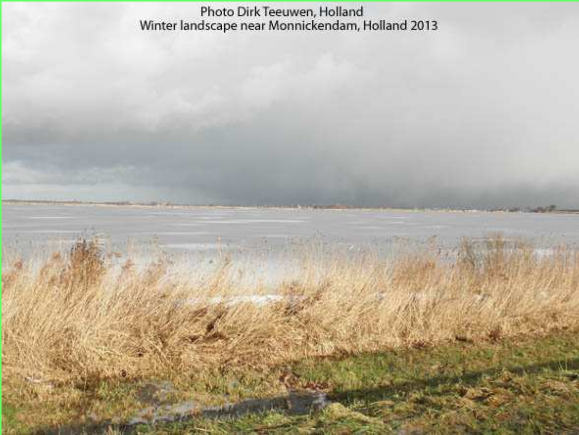
Dirk Teeuwen, Holland