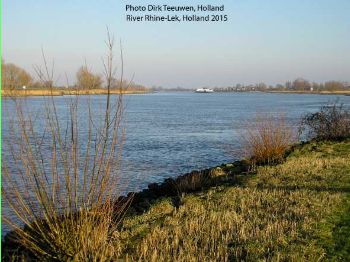
Dirk Teeuwen Holland