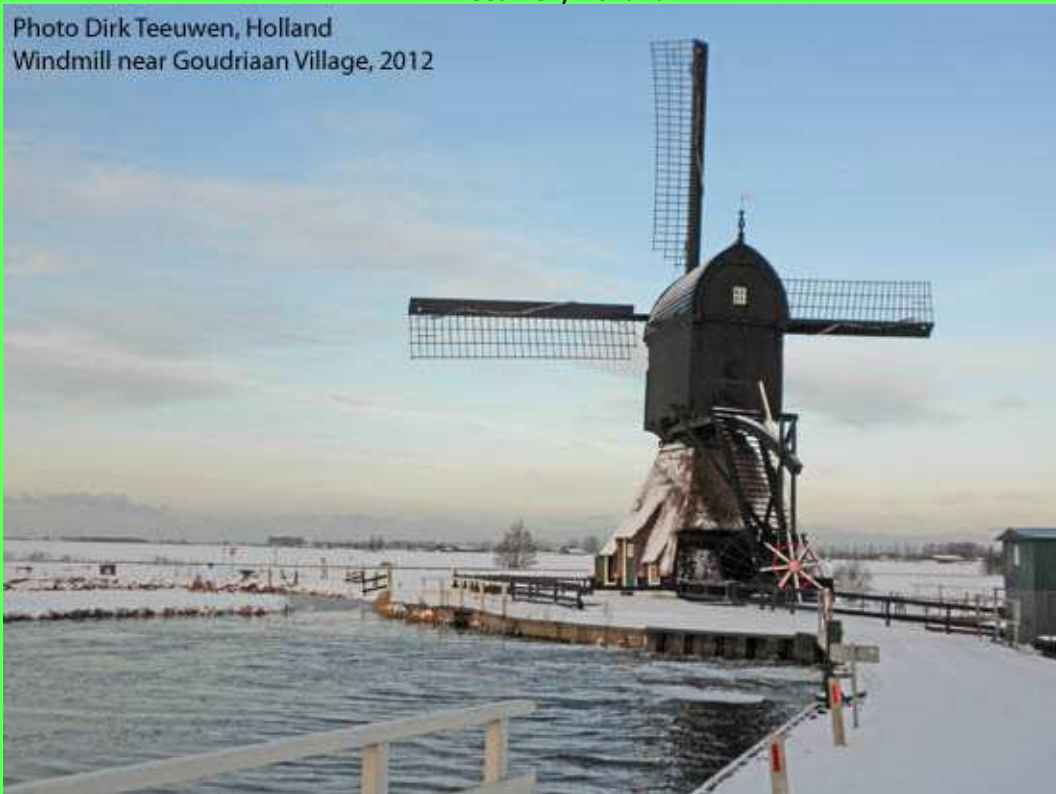
Holland Windmill near Goudriaan Village, 2012