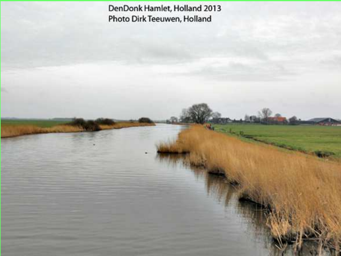
DenDonk Hamlet, Holland 2013