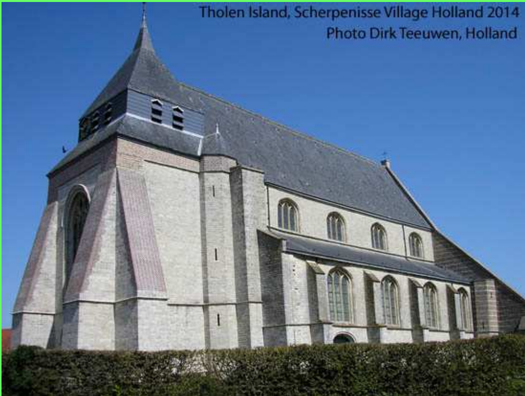
Tholen Island, Scherpenisse Village Holland 2014