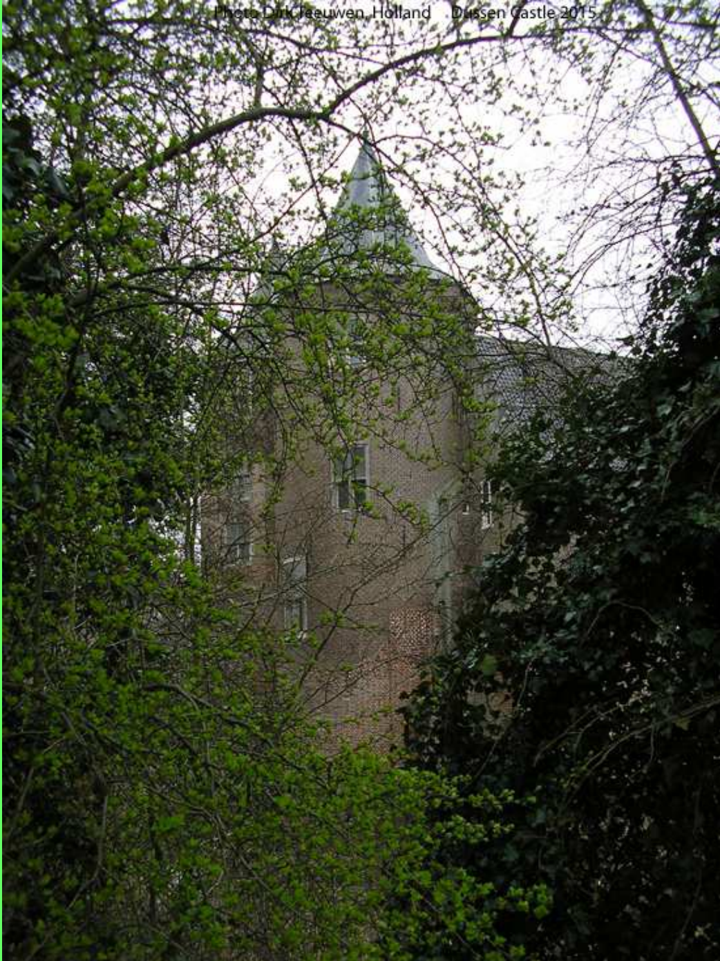
Holland Dussen Castle 2015

A faraway feeling; Dussen Castle in The Netherlands, 2015 The towers are from 1474. The original ones were built in, circa, 1390. Before 1390 there was a keep (donjon, fortified residential tower). Most probably there was a wooden stronghold before 1200 A.C.. The cellars are from before 1390. The tower, the right one I mean, was a local prison in the olden days