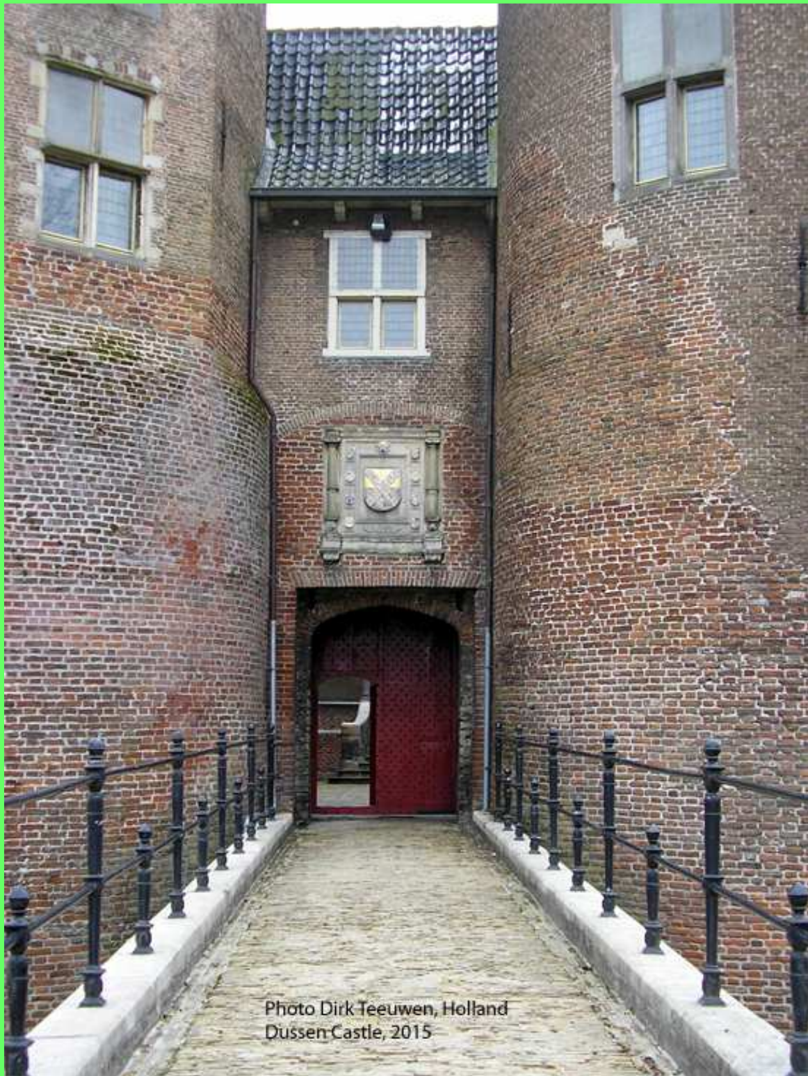
Holland Dussen-Castle, 2015