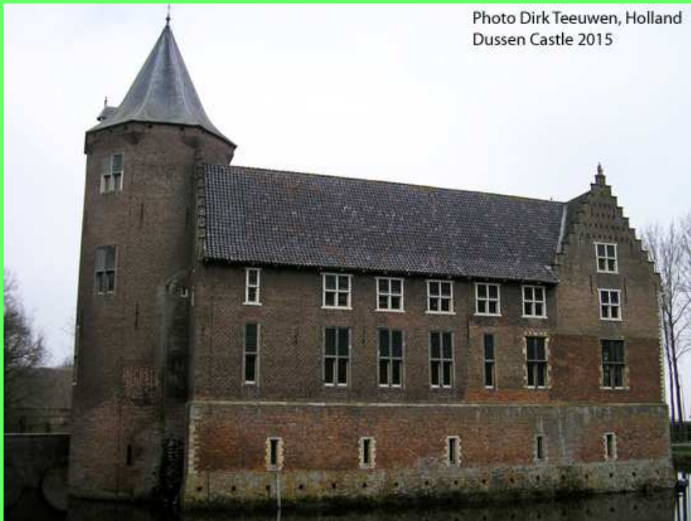
The western part of the castle, Dussen Castle 2015