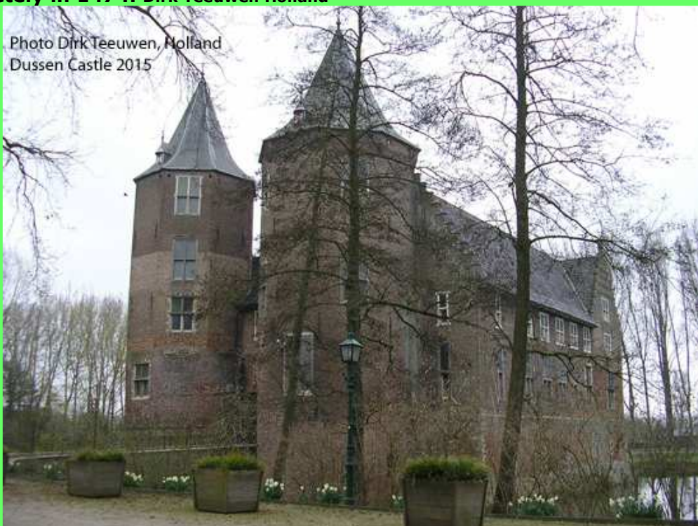
Dussen Castle 2015