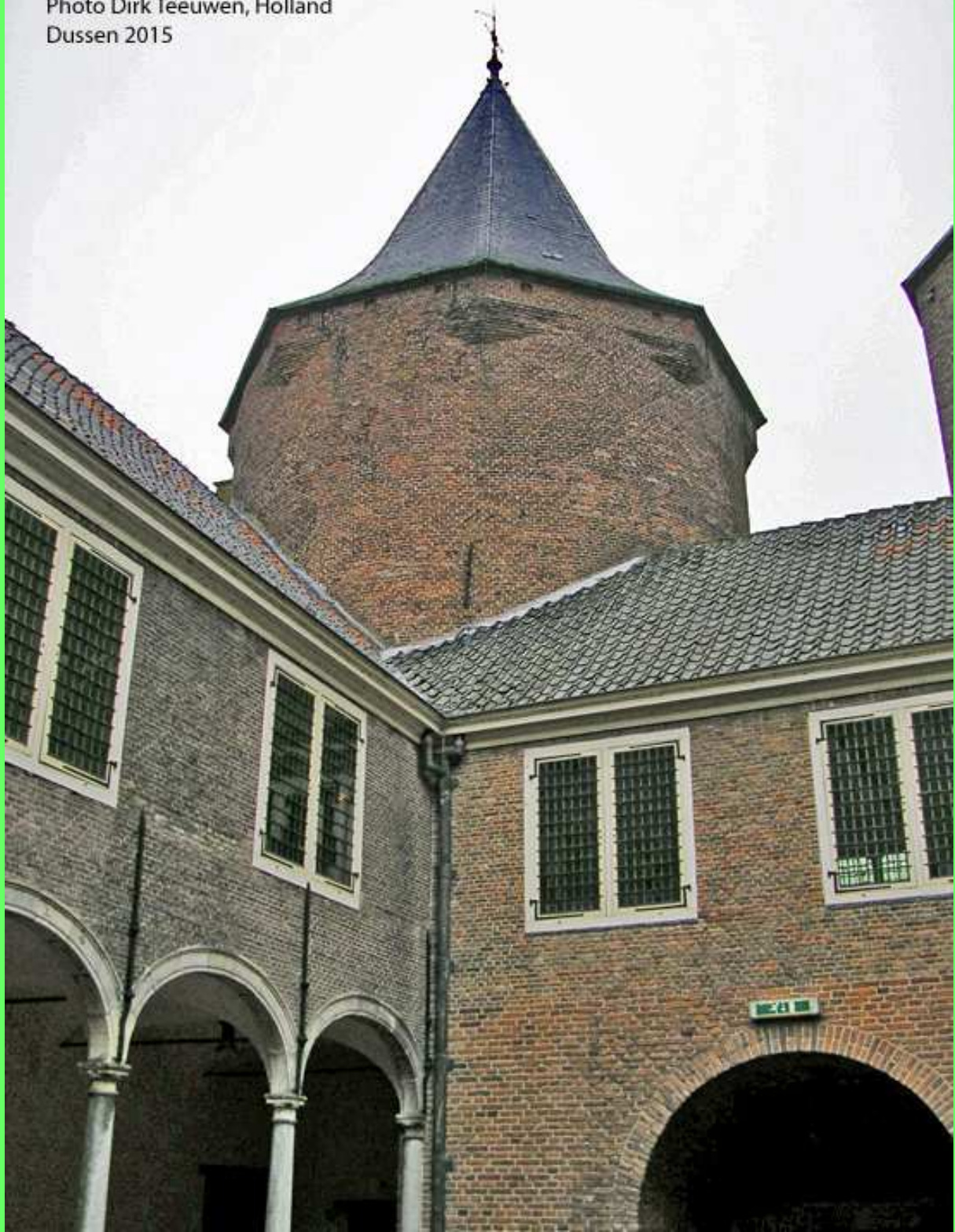
Dussen Castle, inner court, 2015