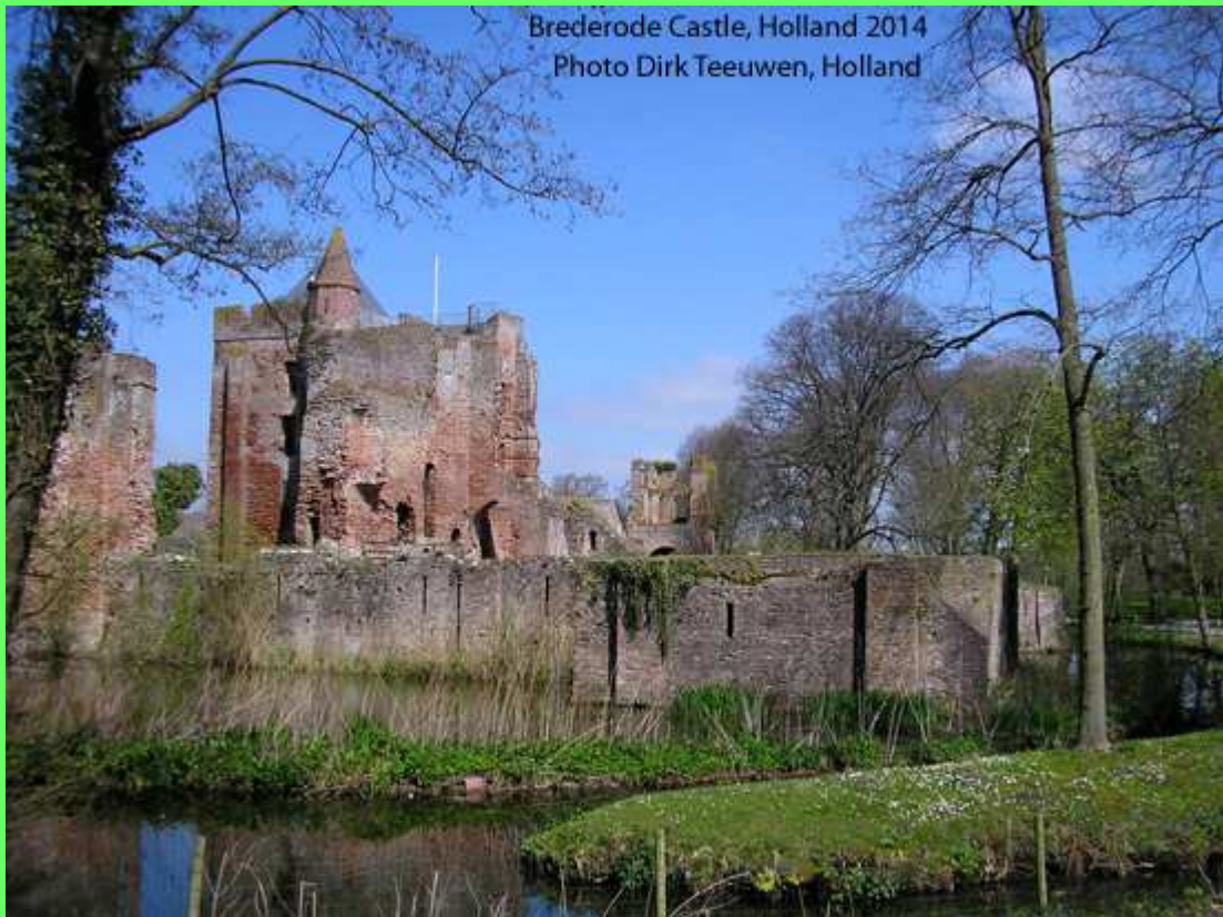
Brederode Castle, Holland 2014