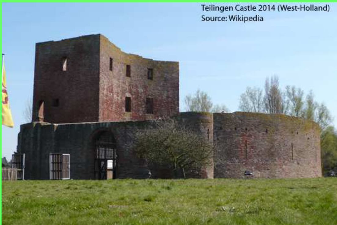
Teilingen Castle 2014 (West-Holland)