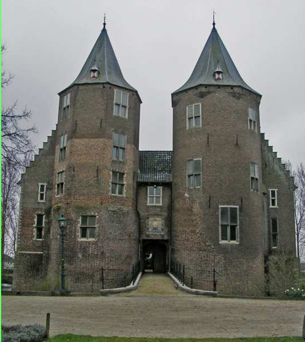
The front of Dussen Castle, Holland 2015

Northern front of Dussen Castle, Holland The front was built circa 1470.