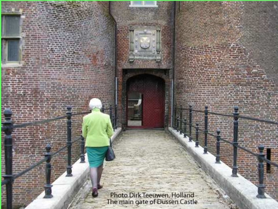
The main gate of Dussen Castle