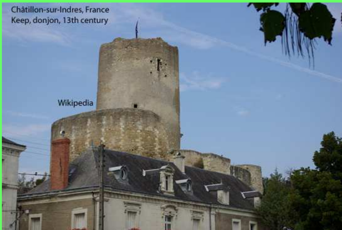
A remain of the early Middle Ages! The keep (donjon) of Châtillon-sur-Indres, France 2015. This small town was visited by us on a too rainy, too stormy day in September 2015.