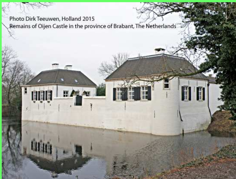
Oijen Caste in The Netherlands, built in 1361, destroyed in 1511. Rebuilt in 1594, partly destroyed in 1837. What you are looking at are the remains of the castle from 1594. Why do I show you this picture? See page 8, chapter 3, Walraven van Gent (van Oijen).