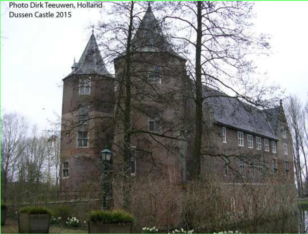
The tower, I mean the right one, has been a local prison for along time. Dussen Castle 2015