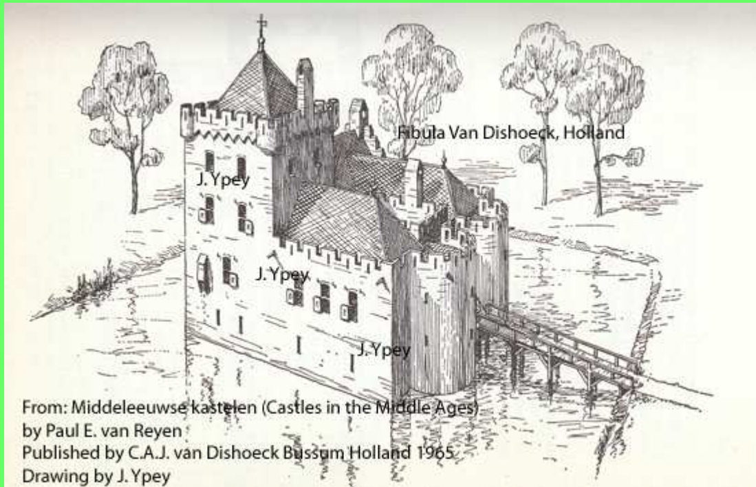
A reconstruction of Dussen Castle, circa 1390 The area of the castle was/is 26-30 meters each way 8 . The walls of the 14 th century cellars were/are 3 meters thick 9 .