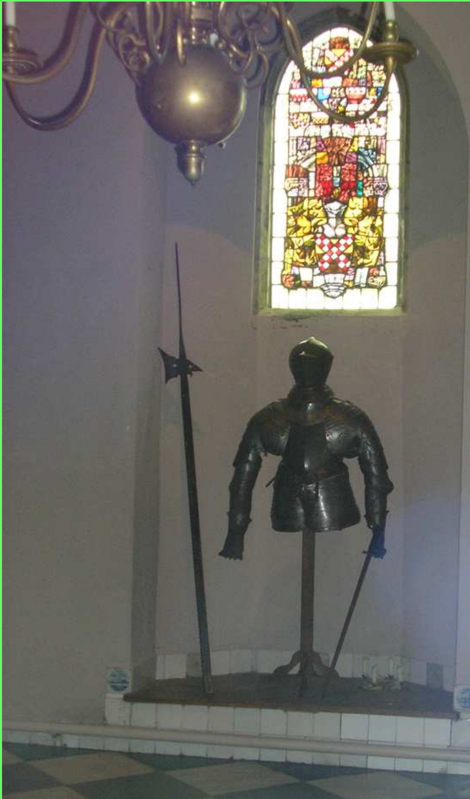
Without words, Dussen Castle 2015