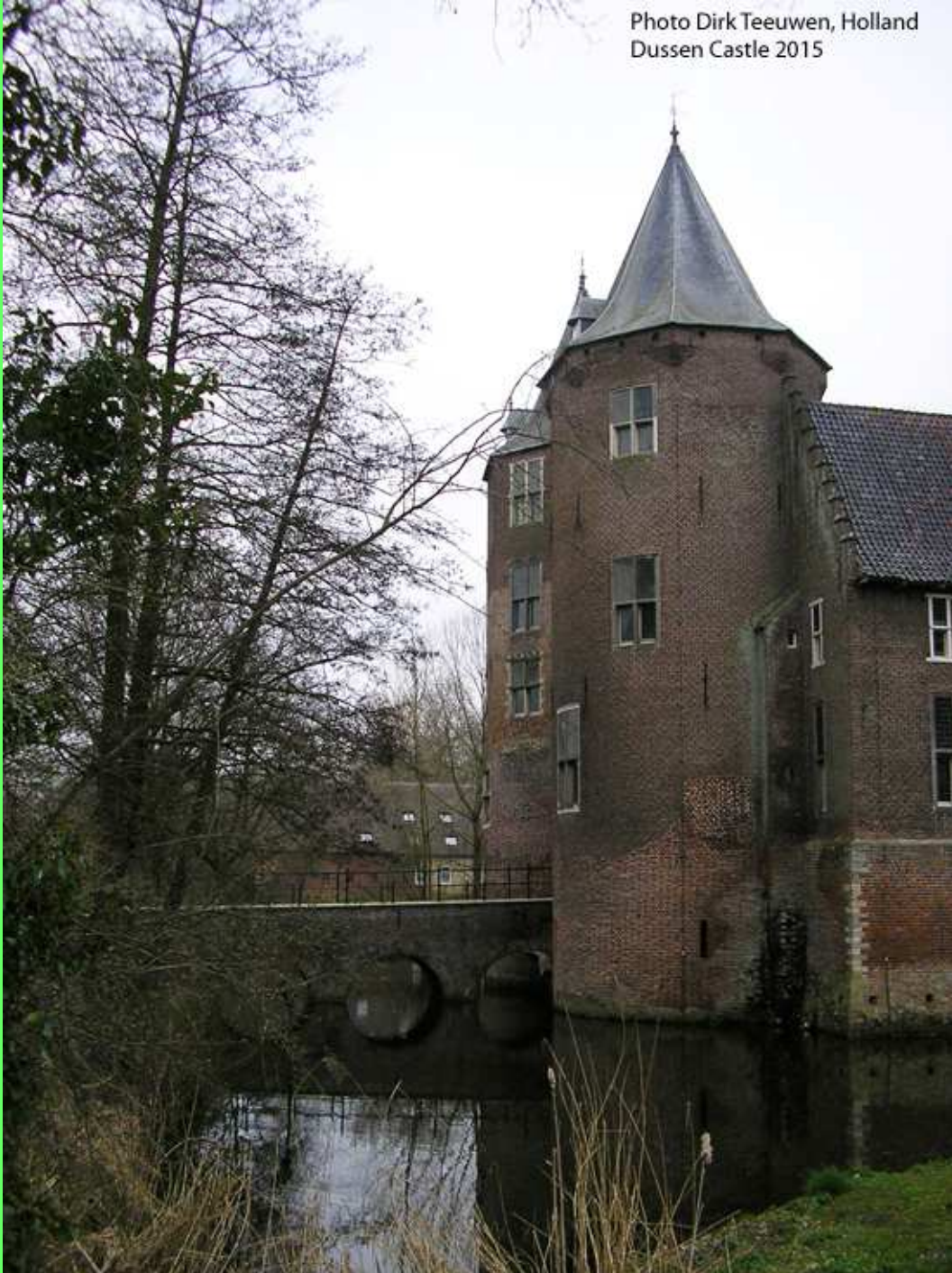
Dussen Castle 2015

Dussen Castle 2015