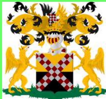
Dirk Teeuwen Holland

Dussen is a small town in the Dutch Province of North-Brabant. Its number of inhabitants nowadays is about 2.100. Dussen was a separate municipality until 1997. From then the community of Dussen is a part of the municipality of the Werkendam Village. Dussen is located in a cluster of polders, called "Land van Altena", about 50 km east from my town of residence, Nieuwpoort Holland. The history of Dussen goes back to the early Middle Ages and Dussen Castle is an illustration of this fact.