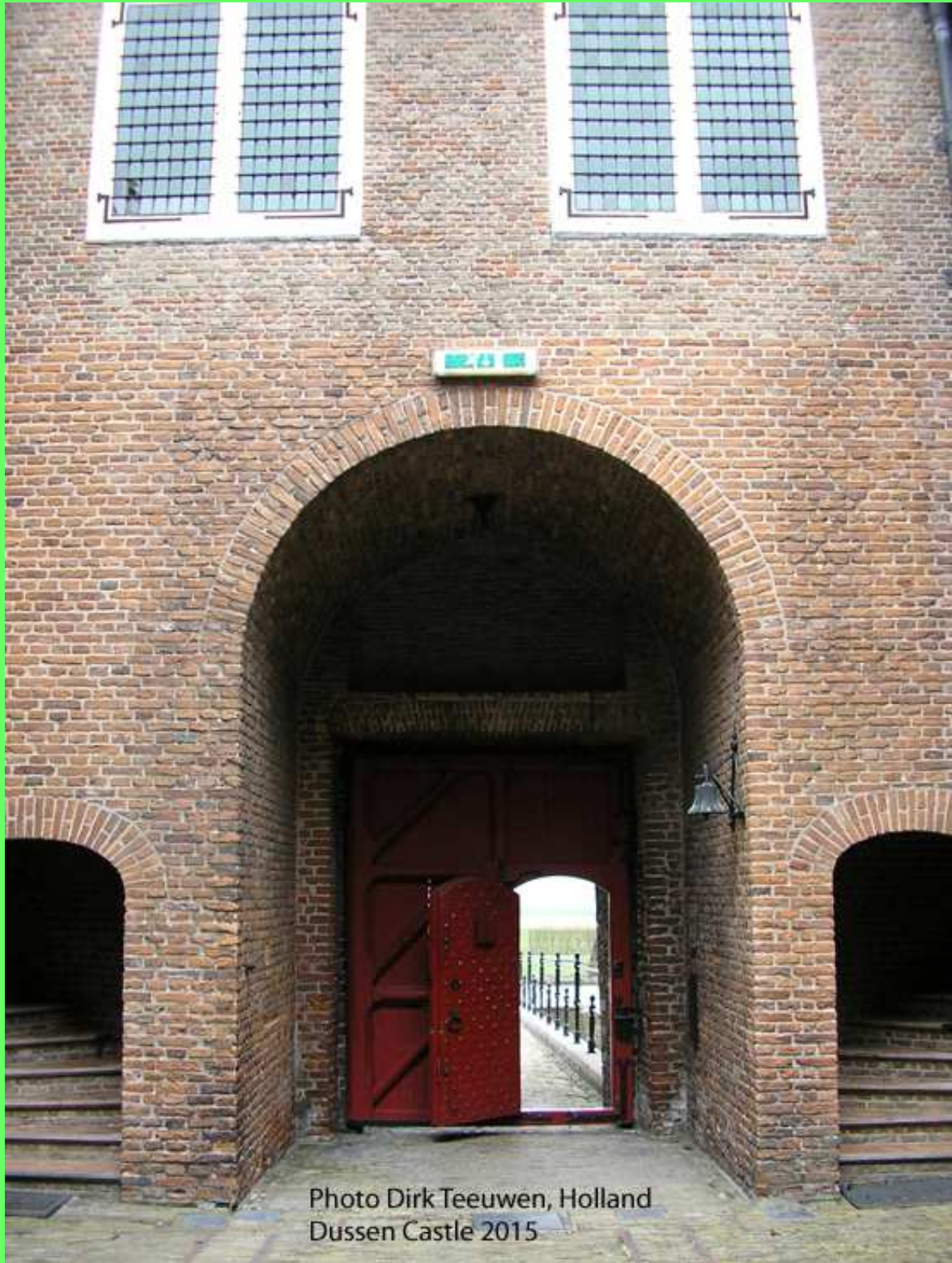
Holland Dussen Castle 2015