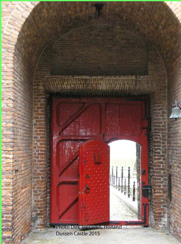
Holland Dussen Castle 2015