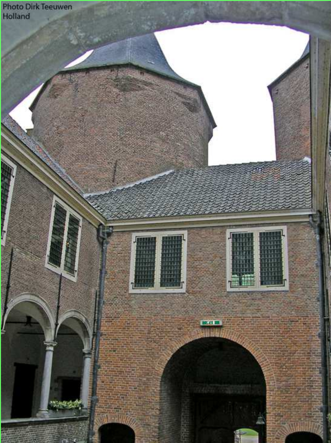
The inner court, Dussen Castle 2015