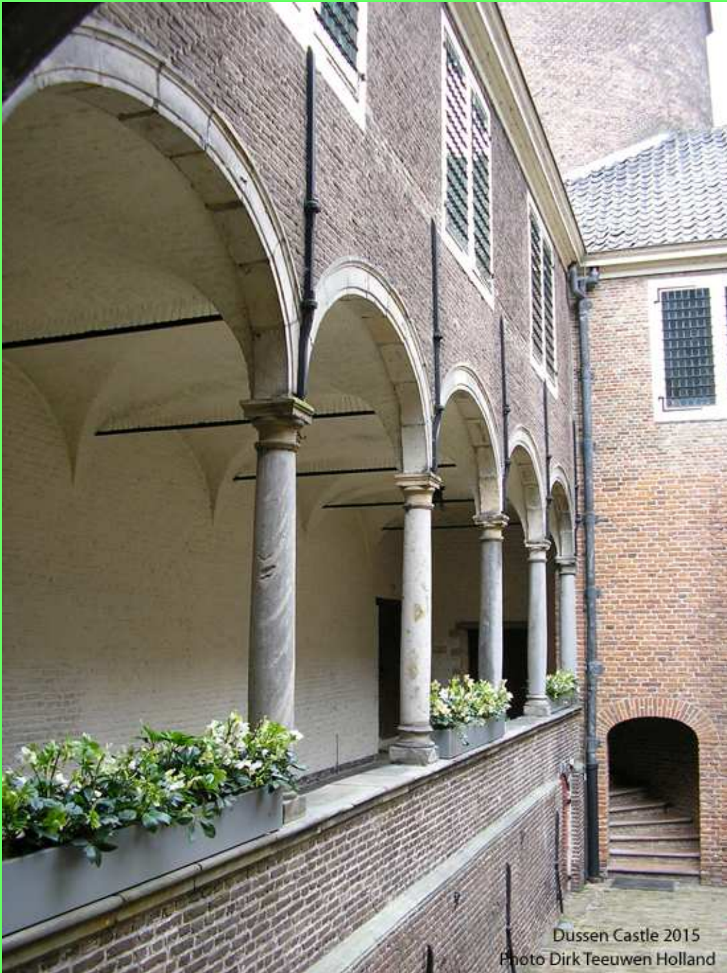
The inner court in renaissance style, Dussen Castle 2015