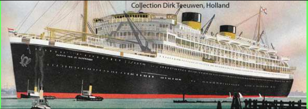
ss Marnix van St Aldegonde, Stoomvaart Maatschappij Nederland, 1936