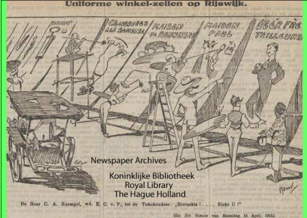
Mockery in the Batavia/Jakarta newspaper “Het Nieuws” (April 15 th 1912) about regulations by the Municipality of Batavia to realize more uniformity regarding awnings and advertising along Batavia’s most elegant shopping street: Rijswijkse Straat/Jalan Majapahit.