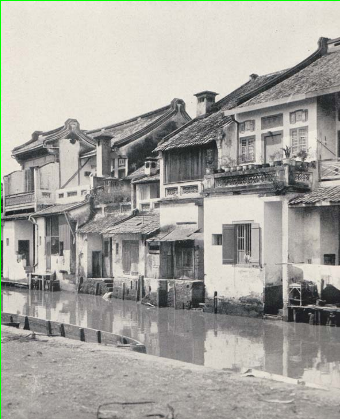
1. Old Dutch-Chinese houses, Pintu Kecil Jakarta – Batavia; photo 1920

The old photographs are from > Haan, dr. F. W. de: Oud Batavia Gedenkboek, Platenalbum (Old Batavia Memorial Book, Picture Album); Batavia 1923 This album is a very valuable book in my personal library. It is not allowed to use these pictures without my consent. The more recent photographs were taken by Dirk Teeuwen, Holland.