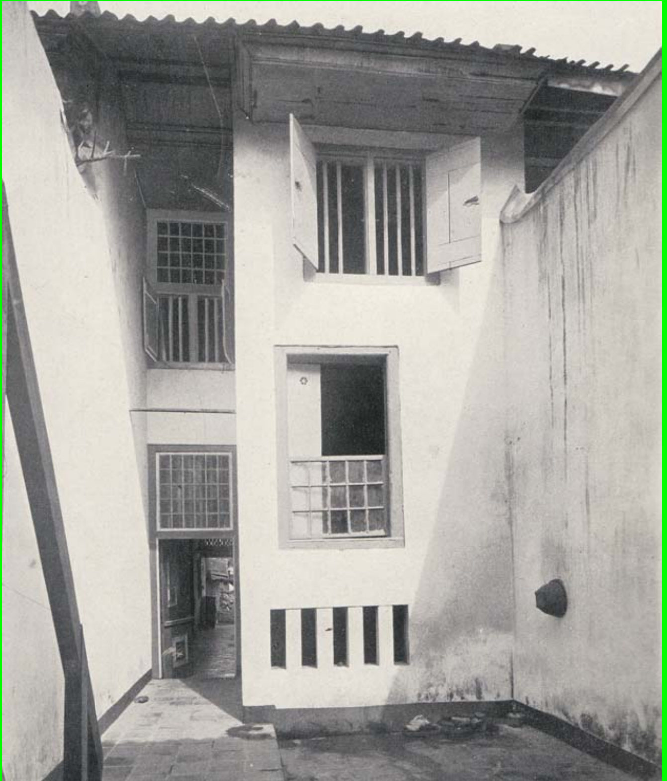
7.b Backyard of the house left on picture 7, Jakarta – Batavia; photo 1920