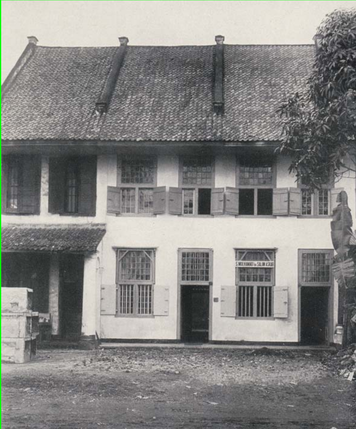
7. Two houses along Rua Malaka (a little bit west from the Kali Besar), Jakarta – Batavia; photo 1920