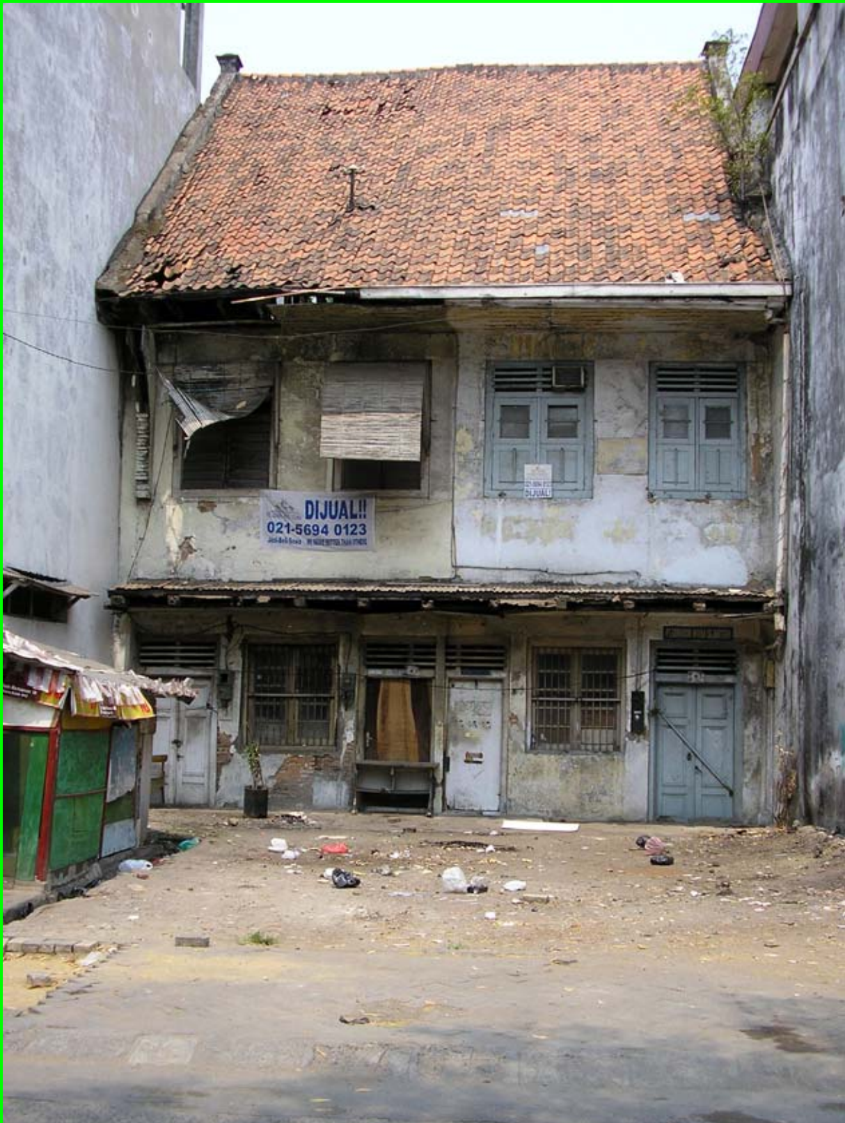
12. Old VOC houses along Rua Malaka (East), Jakarta – Batavia 2006 (I was very close to tears.)