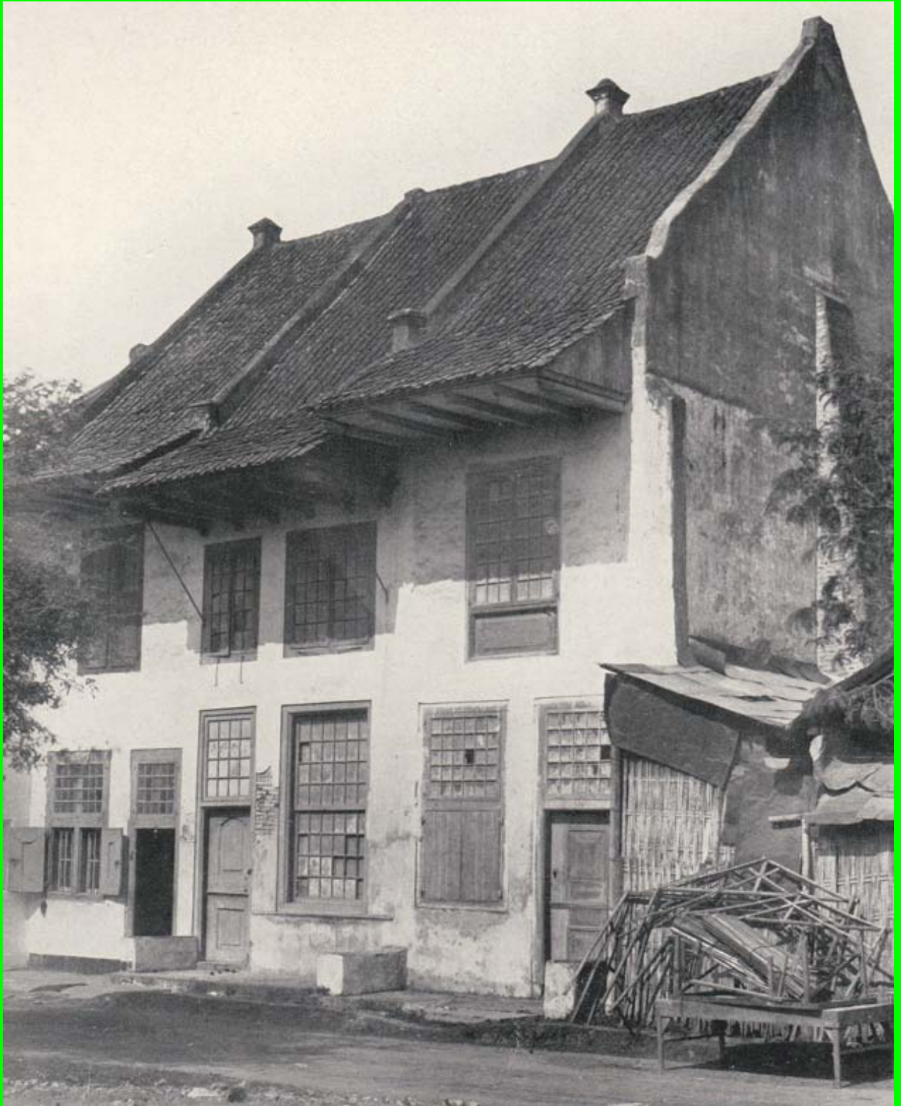
5. Group of old houses along Jl Petak Asam (Spinhuisgracht West), Jakarta – Batavia; photo 1920