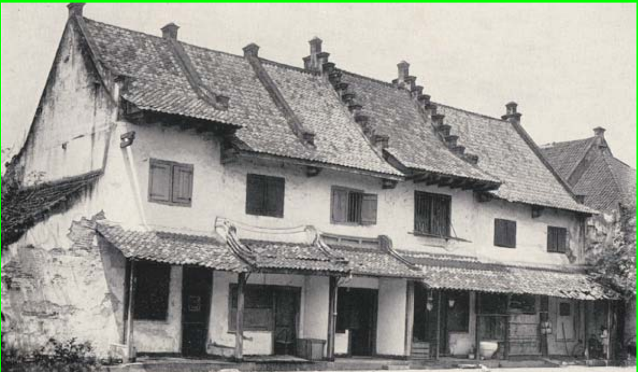
4. Group of five old houses along Jl Kunir (Leeuwinnegracht), Jakarta – Batavia; photo 1920