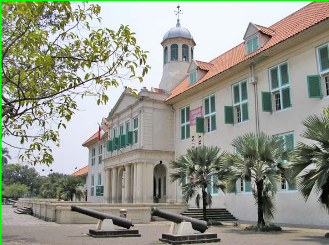
9. Old VOC Town Hall, Jakarta – Batavia 2006