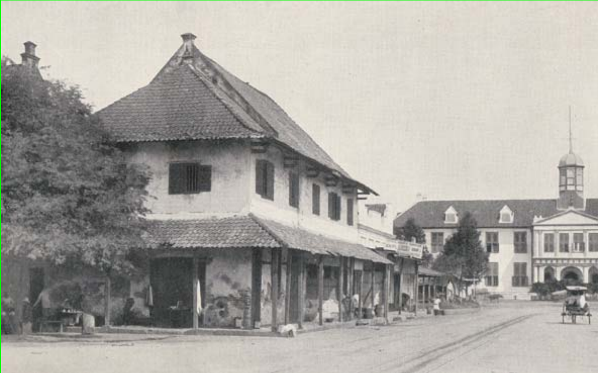
2. Chinese house along Jl Cengke (Prinsenstraat), Jakarta – Batavia; photo 1920 Shops are on the ground floor, living quarters on the first floor.