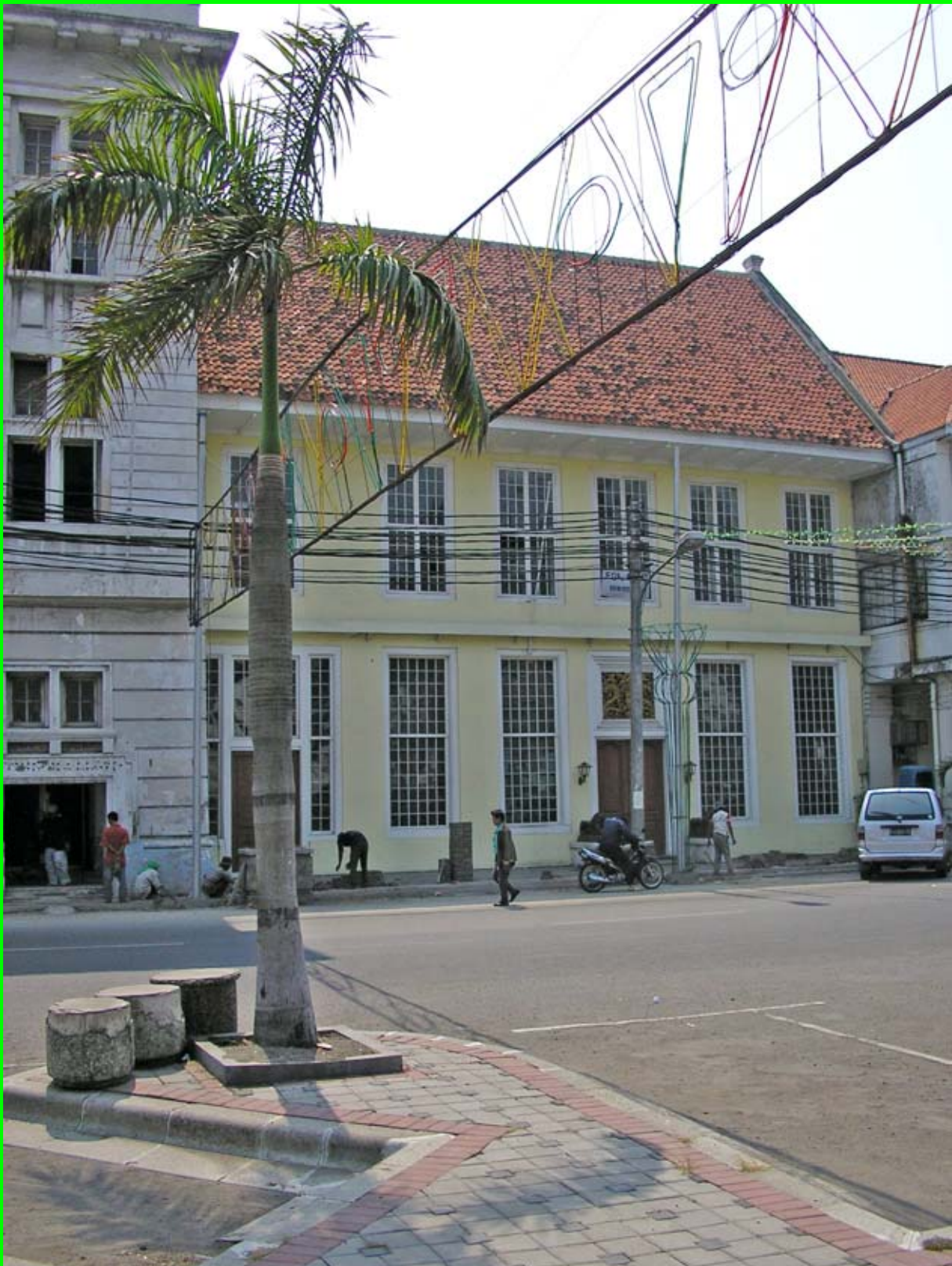
6.a Same town house (see picture 7) in 2006 along Kali Besar West, Jakarta – Batavia 2006