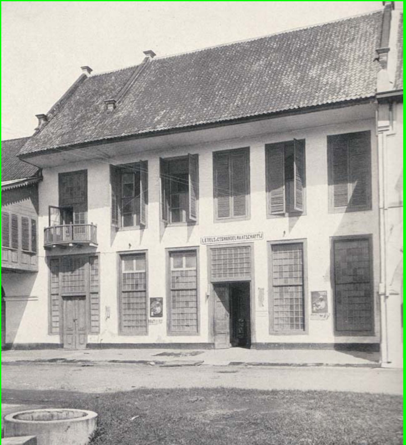
6. Very old Dutch (17 th century) VOC residence (town house) along Kali Besar West, Jakarta – Batavia; photo 1920 See also picture 8.