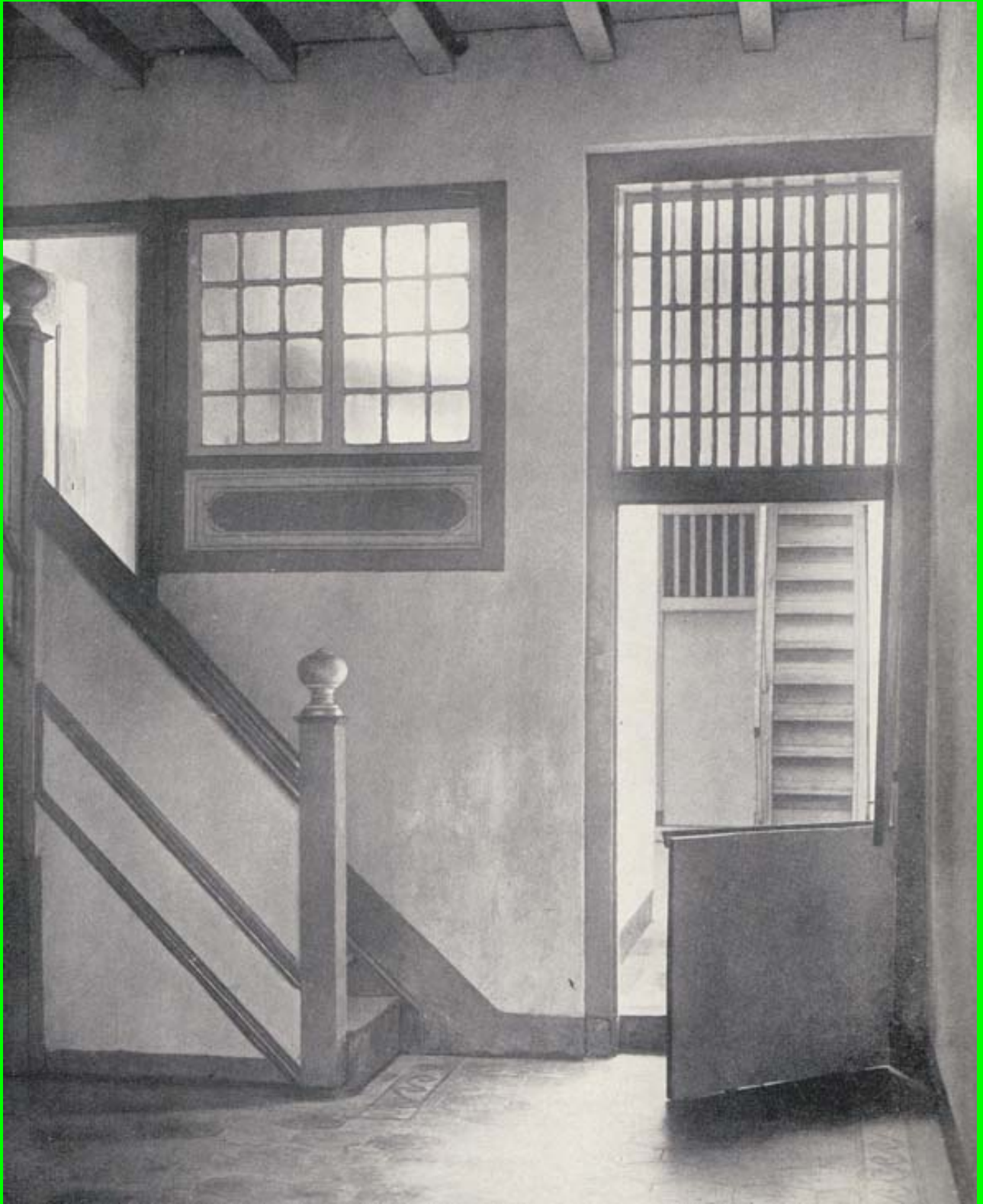
7. a Entrance hall of the house left on picture 7, Jakarta – Batavia; photo 1920