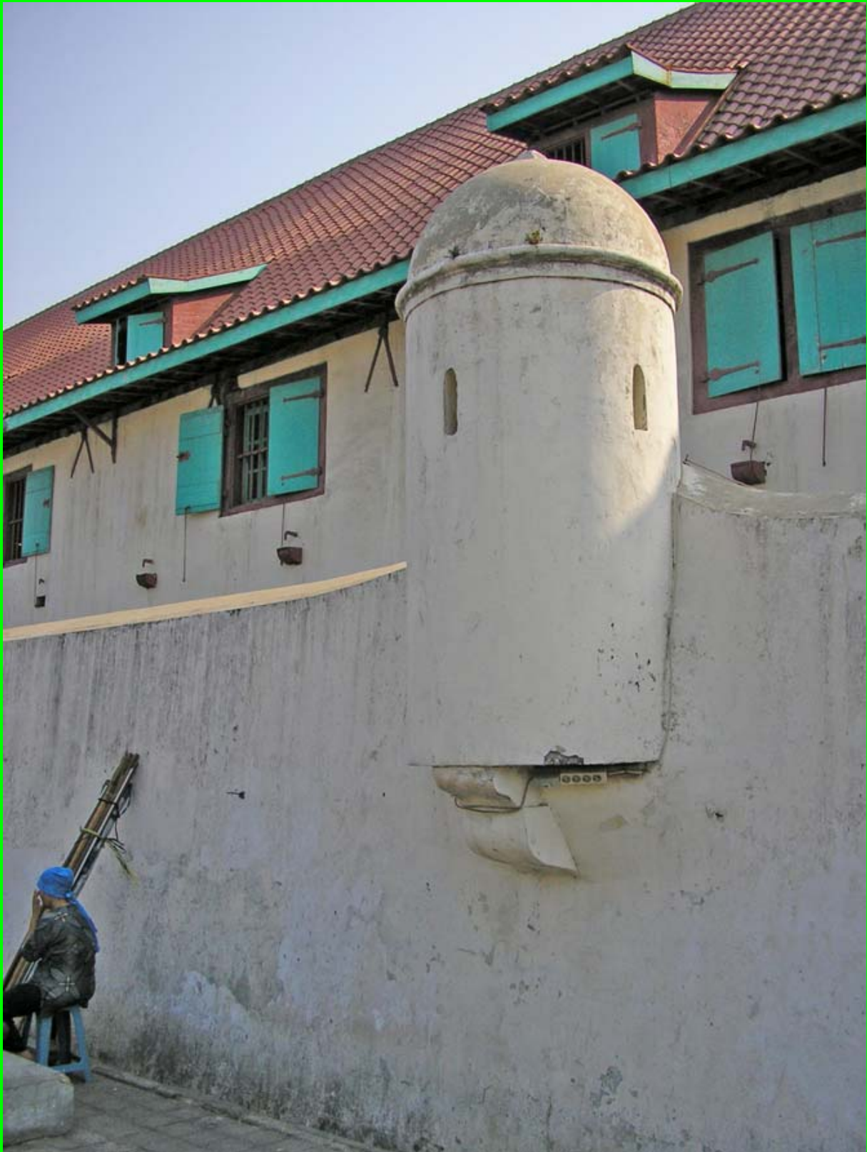
11. Directly east from Museum Behari (Westzijdse Pakhuizen) along Sunda Kelapa West (Oude Havenkanaal West), Jakarta – Batavia 2006