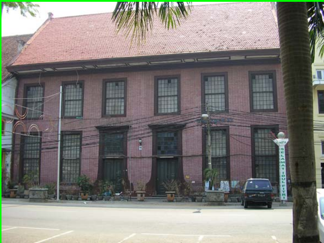
10. Toko Merah (the Red Shop) a town house from the 17th century, now an office, along Kali Besar West, Jakarta – Batavia 2006