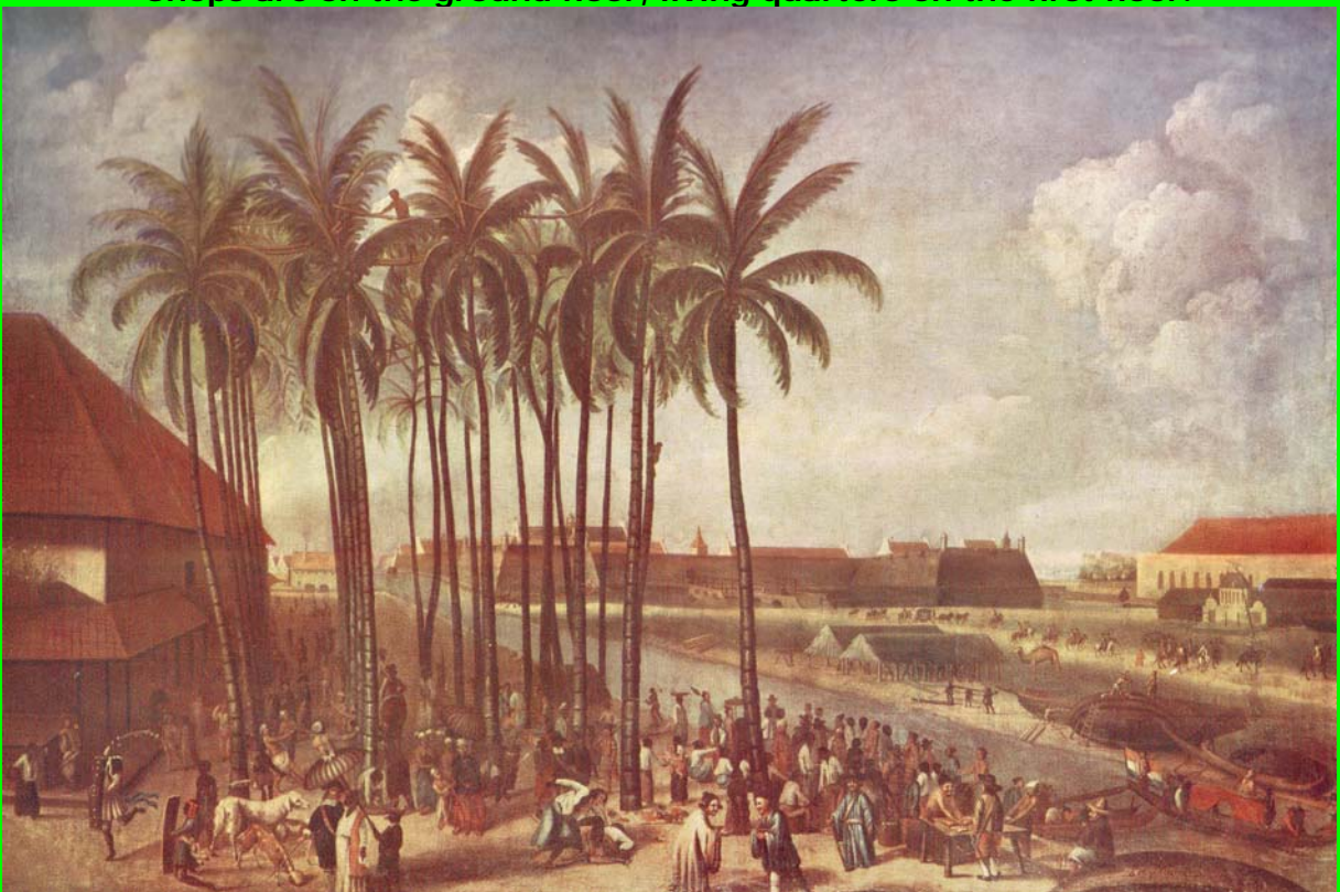
2.a Painting by Beekman, Jakarta – Batavia 1650. Kali Besar to the north, the Batavia's VOC-Castle is clearly visible. Left a Chinese house with shops on the ground floor and living quarters on the first floor. Picture 2 shows us exactly the same type of this Chinese house (Seems like time stood still: 1650 and 1920!!!).