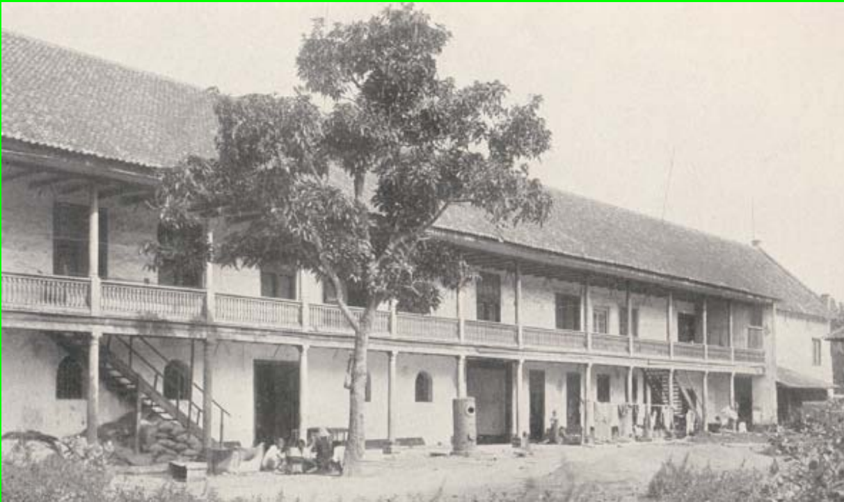
3. VOC carpenter's yard along Kali Besar West, Jakarta – Batavia; photo 1920 Is still there, but badly restored.