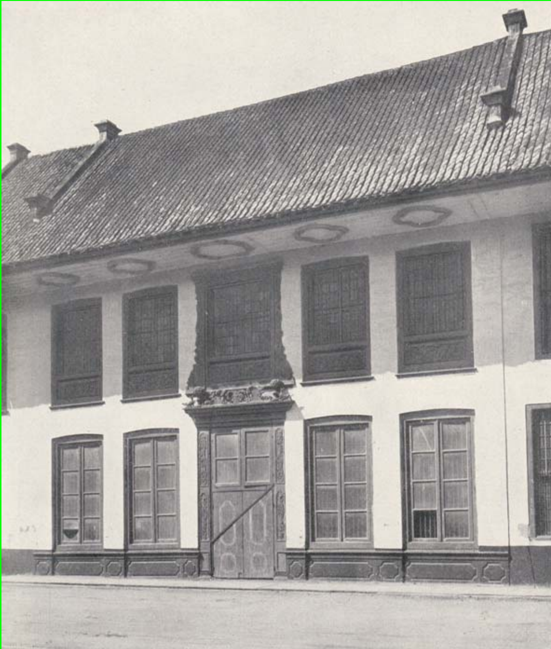
8. Town house along Jl Pintu Besar Utara (Binnen Nieuwpoortstraat) only a few steps west from the old VOC Town Hall (Jakarta History Museum), Jakarta – Batavia; photo 1920