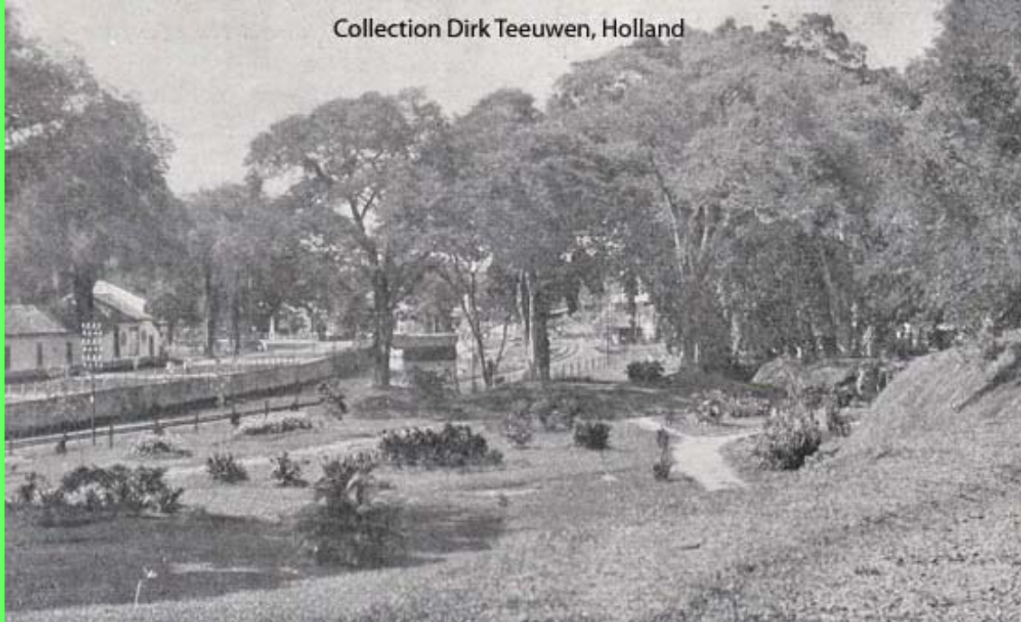
9. The fort's north-eastern bastion and clock tower, Batavia – Jakarta 1924