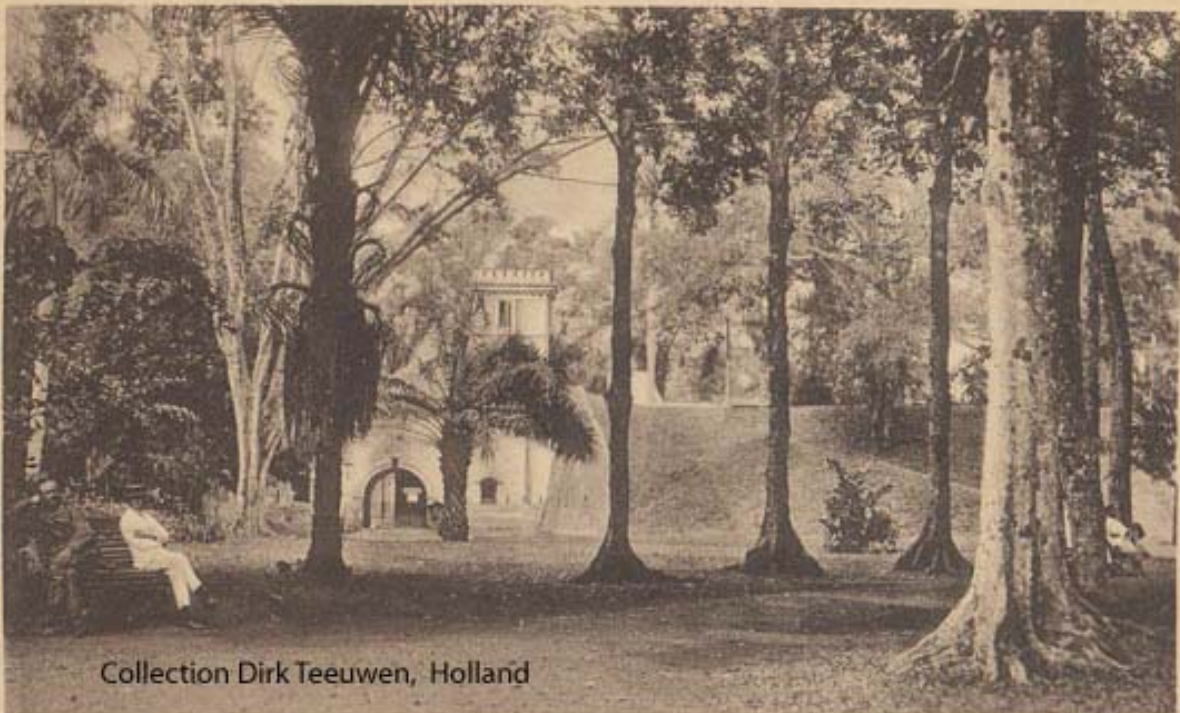
Collection Dirk Teeuwen, Holland