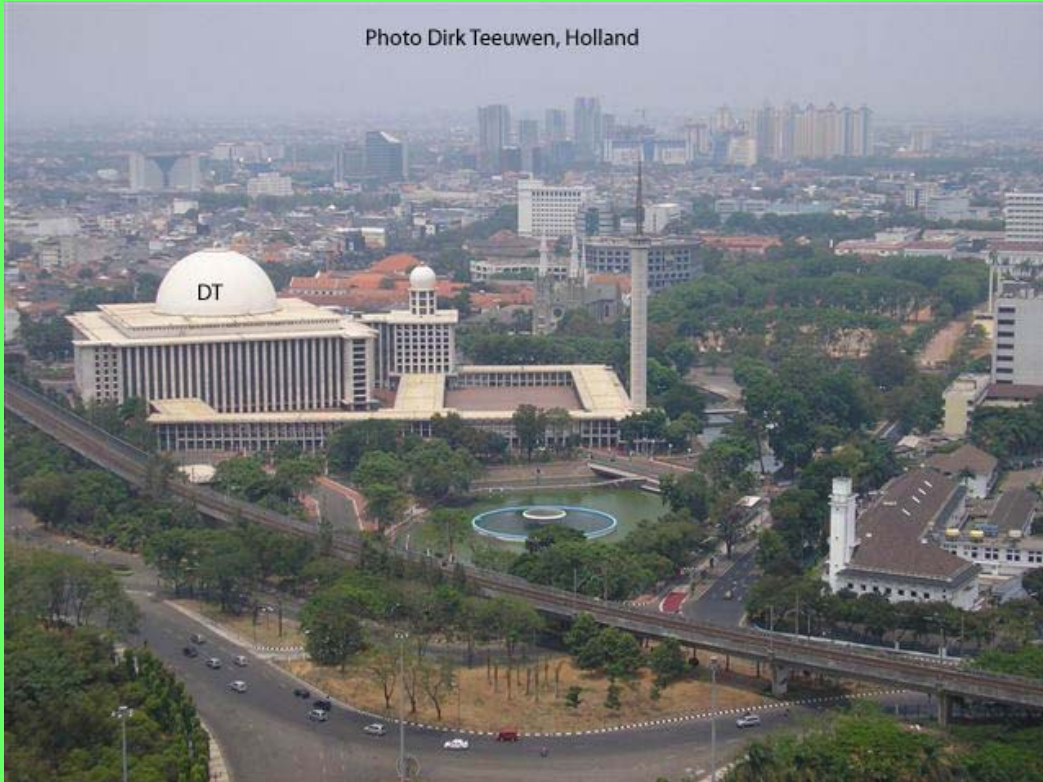
1. Mosque Istiqlal from the watch tower "Monas" on Medan Merdeka, formerly Koningsplein (King's Square), Jakarta 2006

See also my article "Batavia's Wilhelmina Park – Jakarta's Mosque Istiqlal". Return to the index page and click Medan Merdeka. Account of sources: see my article.