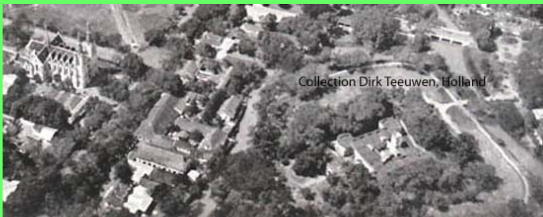
4. Detail A