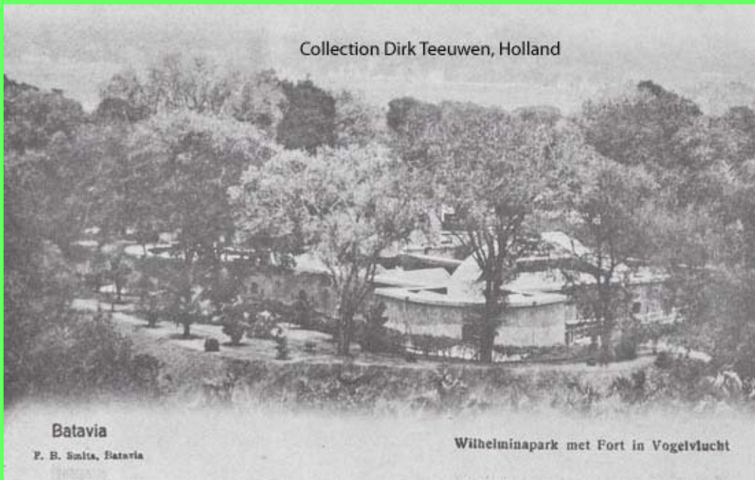
7. Two out of four bastions and at right the main gate, Batavia – Jakarta 1922