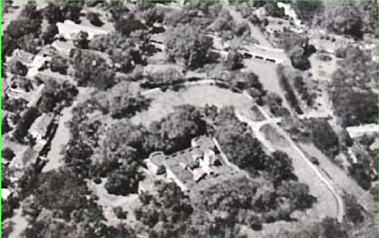
5. Detail B