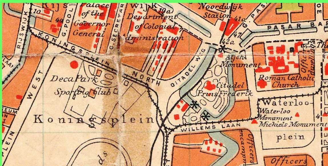
2. The northern part of Koningsplein (King's Square) / Medan Merdeka and its vicinity to the east, Batavia – Jakarta 1914.