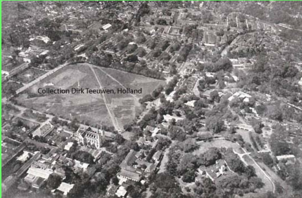
3. A bird's eye view at the Katholieke Katedraal (Catholic Cathedral) / Gereja Katolik at Waterlooplein / Lapangan Banteng and at Citadel Prins Frederik in the centre of Wilhelmina Park (right below); Batavia – Jakarta 1928

A bird's eye view and two details from this view: