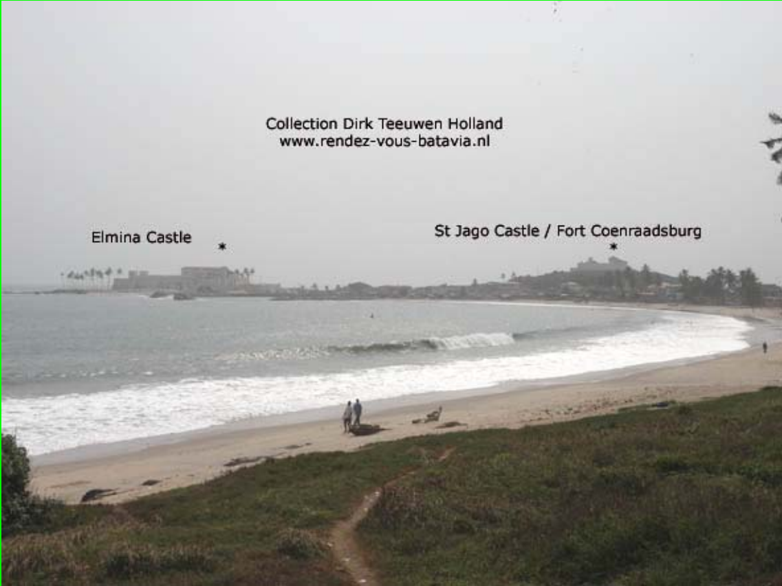
P.2 Elmina and St Jago Castle on a late afternoon, Ghana 2009 P.3 Elmina from the south, Ghana 2009