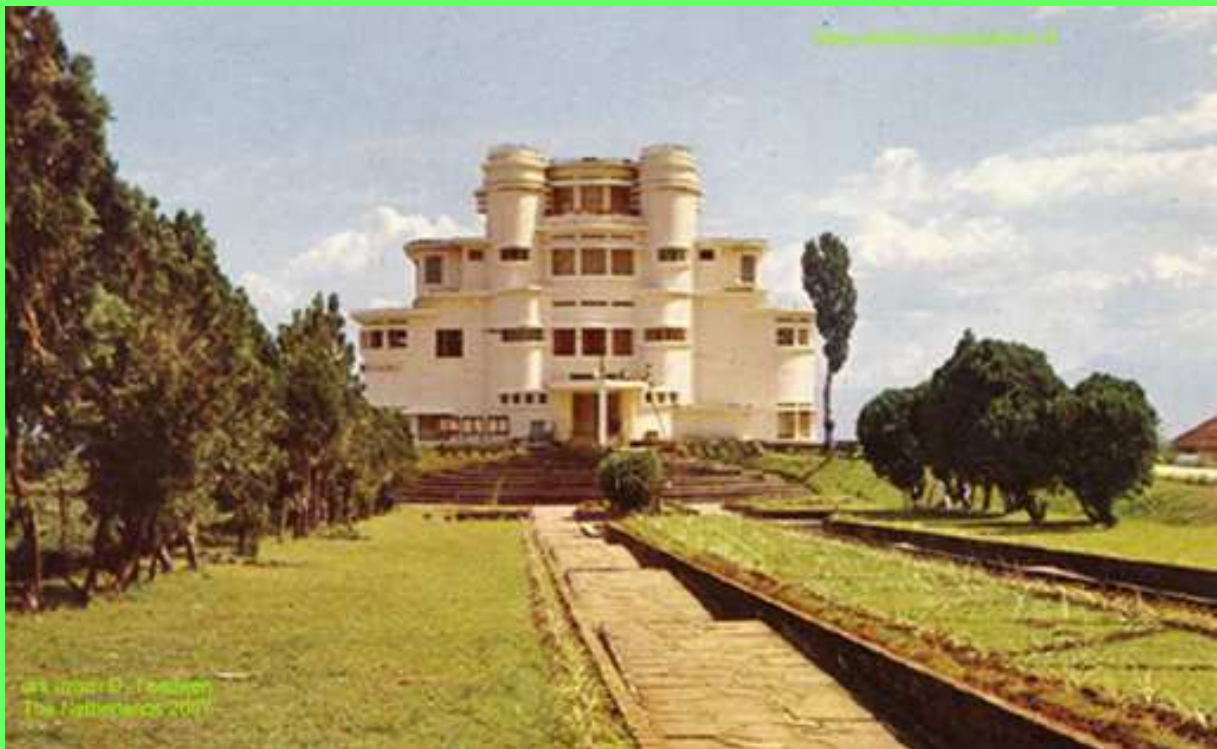
Picture 1. Villa Isola,northern façade, Bandung 1956