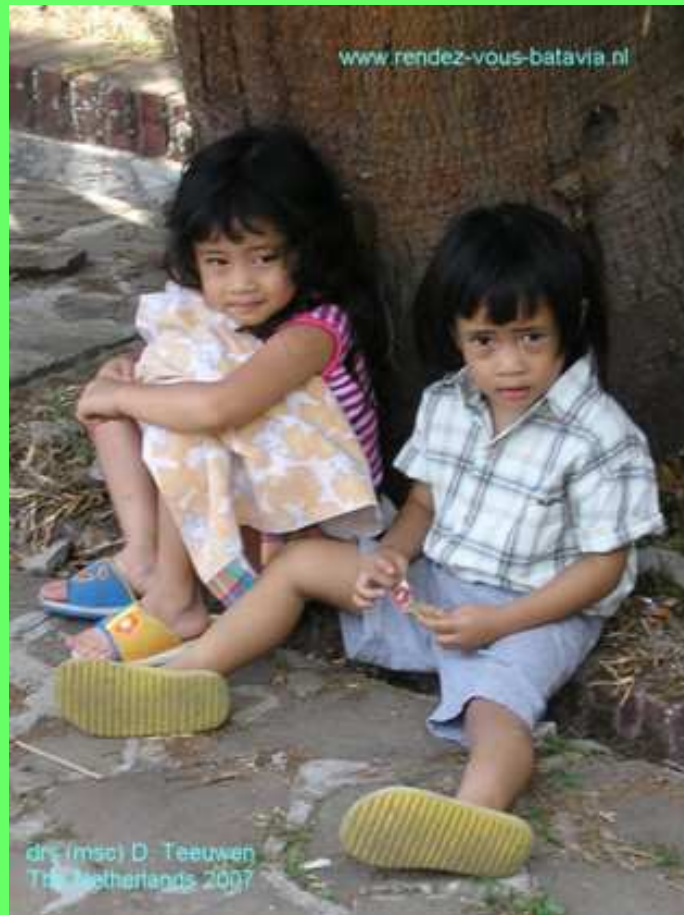
Picture 4. (below, of course) Speechless with architectural admiration