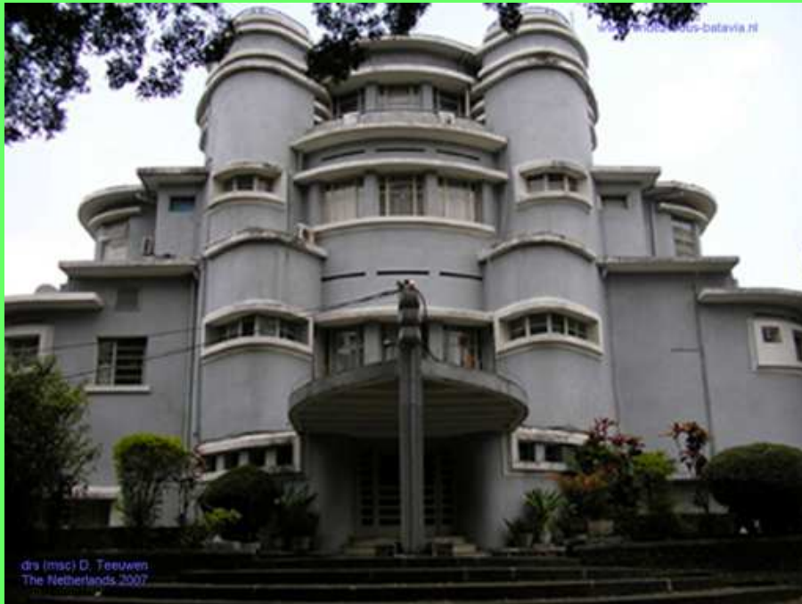
Picture 2. The northern façade of Villa Isola along Jalan Setiabudi, in 2006 Sunny skies were not expected.