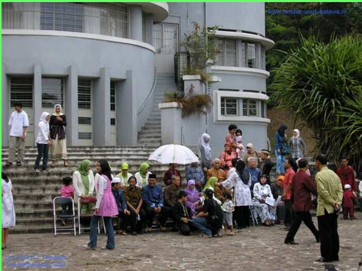
Picture 3. Villa Isola, Bandung 2006, a happy family in an elated mood because of Idul Fitri