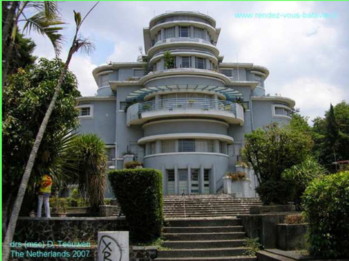
Picture 6. Villa Isola, southern side, with a new floor on top, Bandung 2006