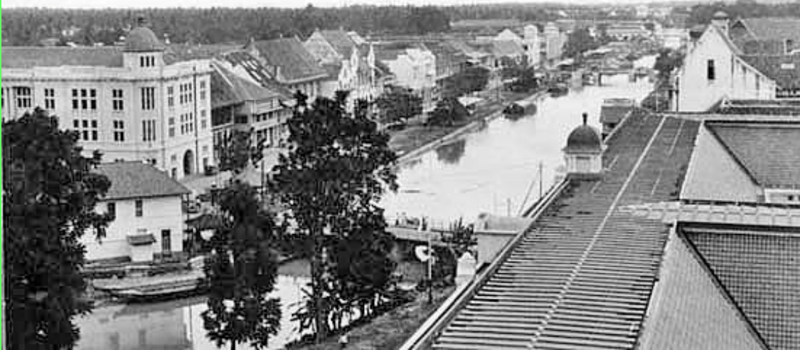
2 Southern side of Jakarta's Kali Besar Barat, 1930

Wikipedia, Tropenmuseum NL, public domain Kali Besar Barat/West, 1930