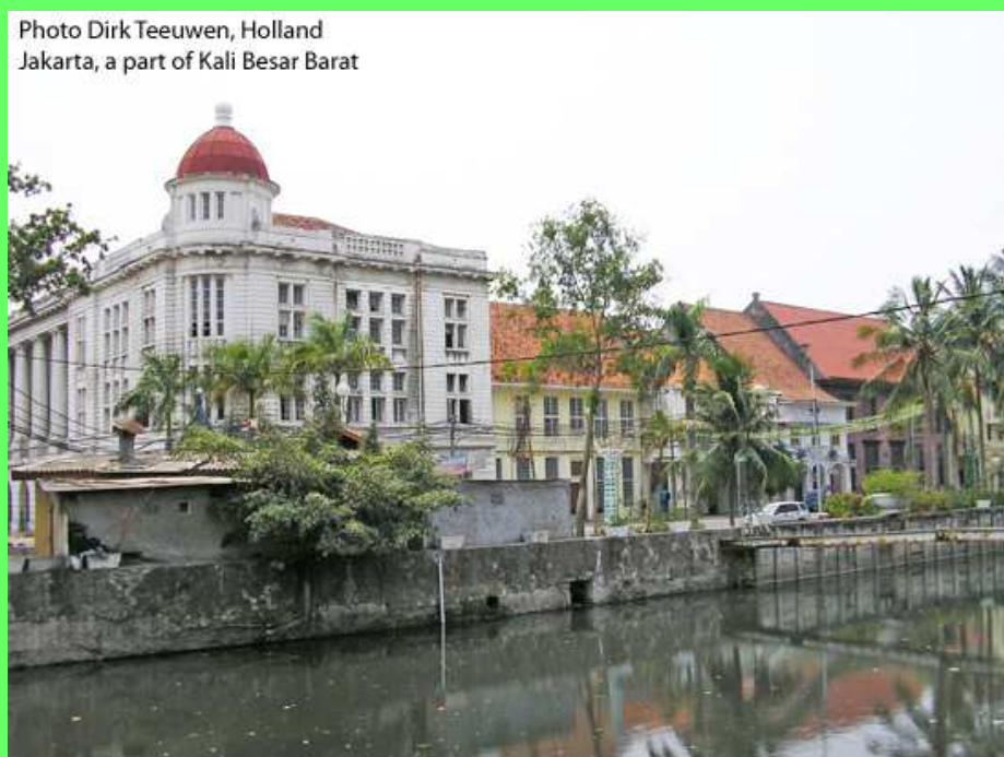
1 Chartered Bank, Kali Besar Barat 1998