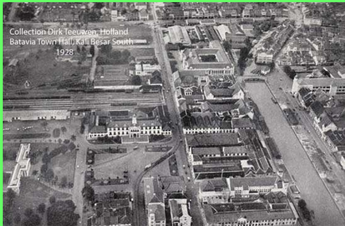
3 Kali Besar to the south in 1928 On the right side of the picture you can see Bank Bridge and the Chartered Bank building with the cupola.