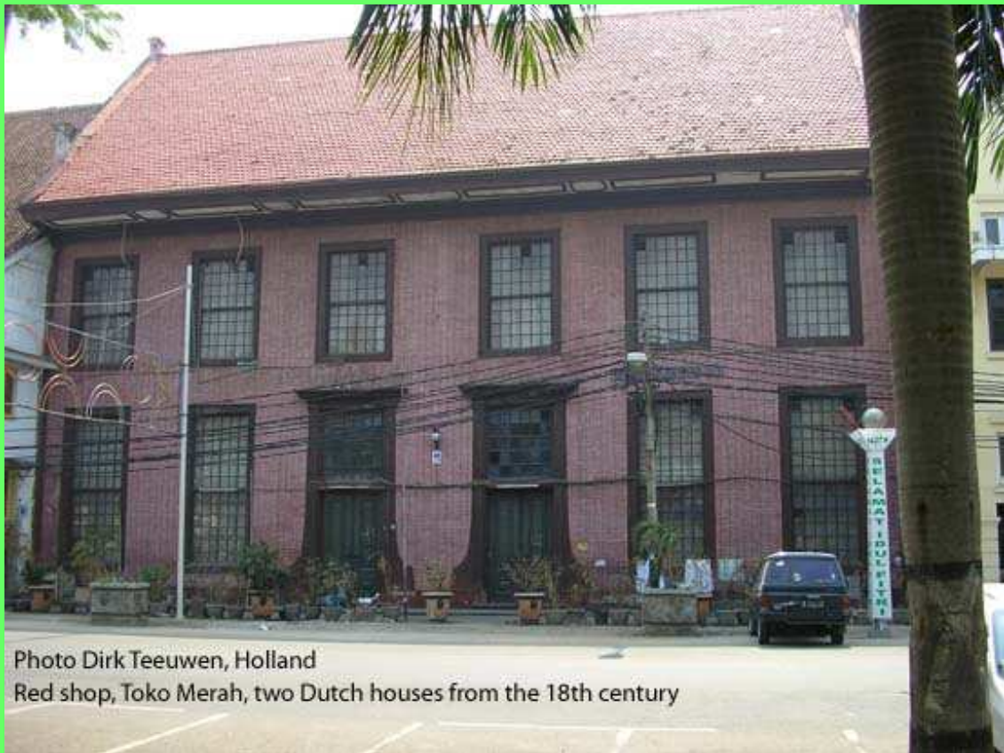
Red shop, Toko Merah, two Dutch houses from the 18th century