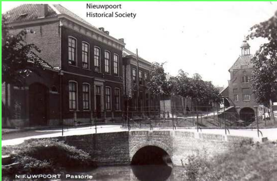
7. The old Inner Harbour, north-west, left from us the old protestant parsonage (rectory); Nieuwpoort Holland circa 1955