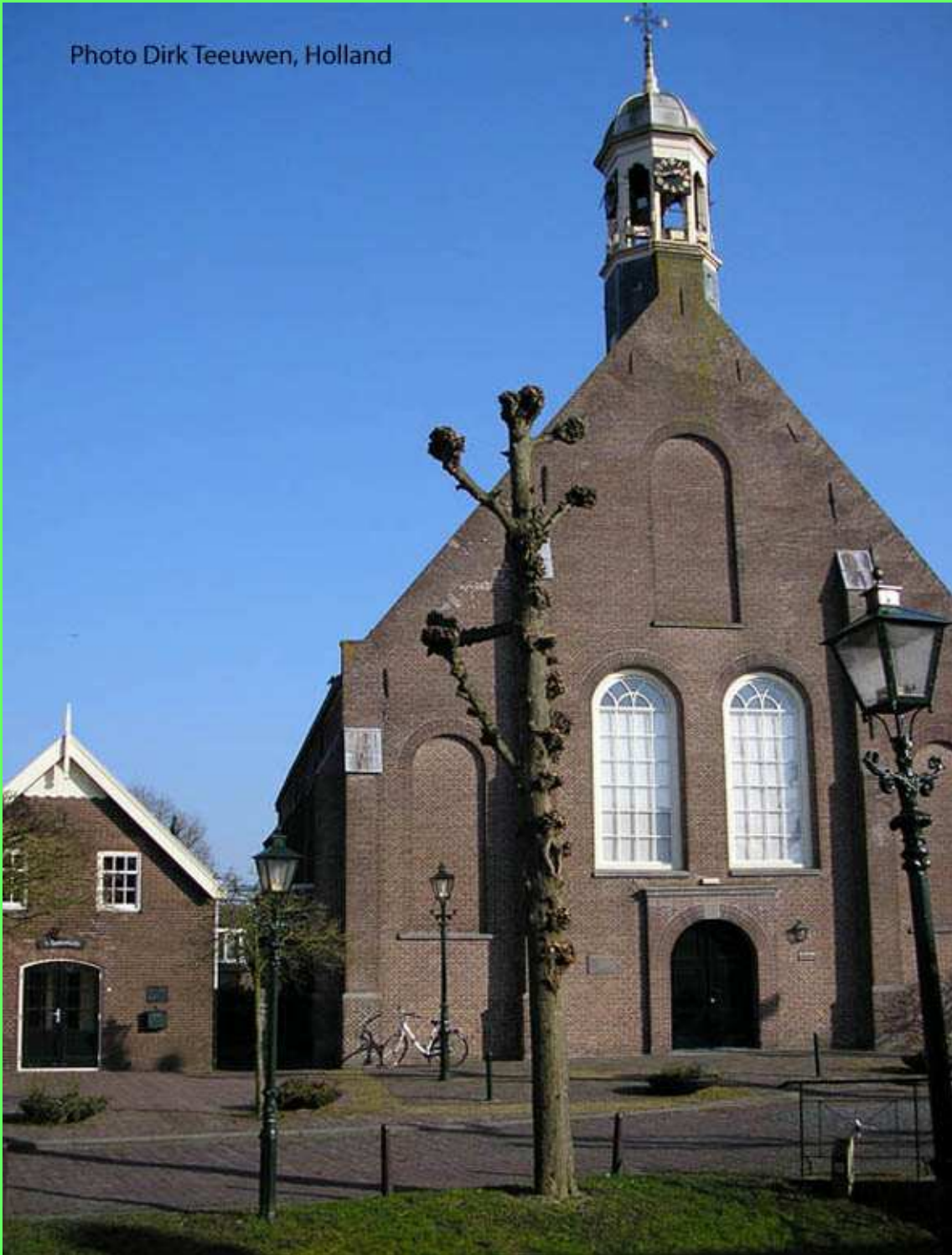
15. The 13 th -18 th century protestant, Dutch Reformed, church; Nieuwpoort Holland 2015