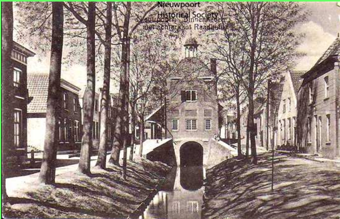
3. The old Inner Harbour and backside of the Town Hall; Nieuwpoort Holland circa 1930