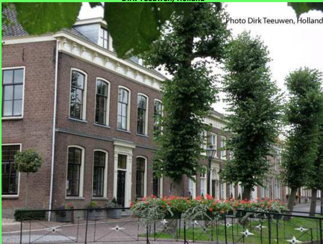
6. Left from us the old protestant parsonage (rectory), directly right from the parsonage the annex of the Town Hall: between two trees. Nieuwpoort Holland 2015