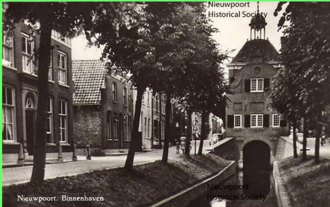
5. The old Inner Harbour and backside of the Town Hall; Nieuwpoort Holland circa 1950. The building, far left, was an annex of the Town Hall (right).