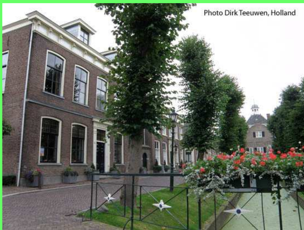
8. See 7, same location; Nieuwpoort Holland 2015