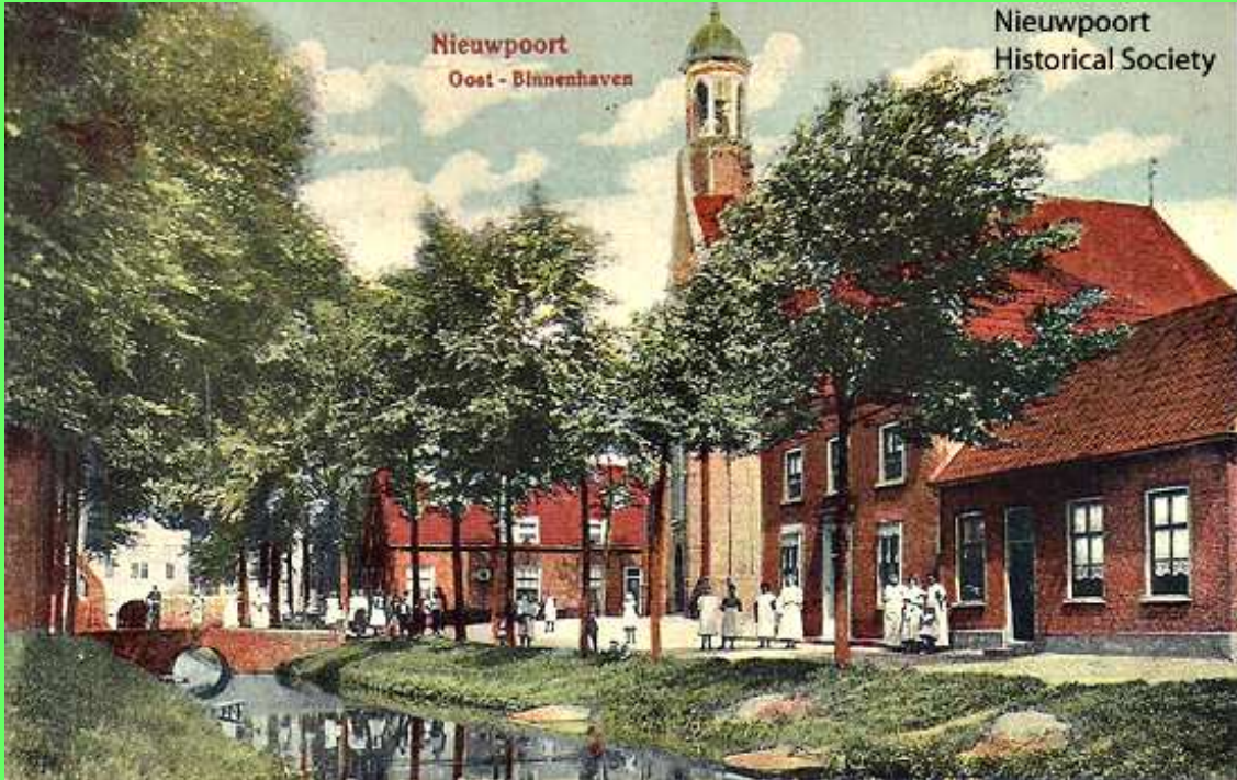
13. The old Inner Harbour, east; Nieuwpoort Holland circa 1920