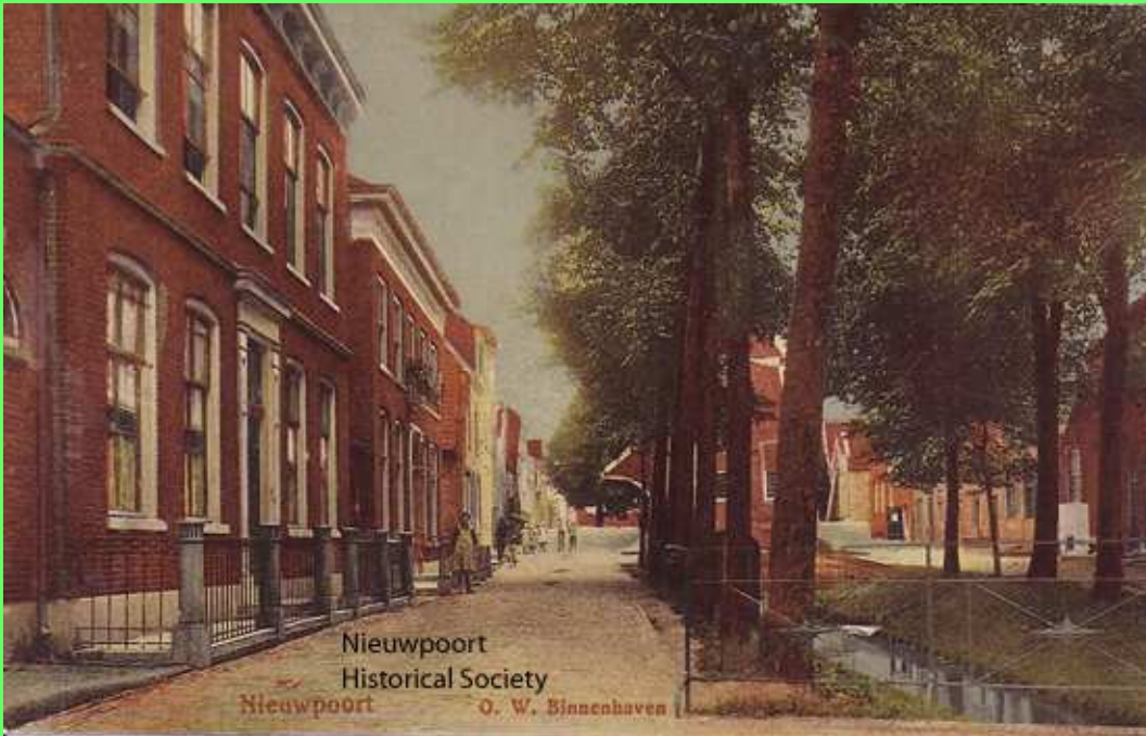
9. The old Inner Harbour, north-west, left from us the old protestant parsonage (rectory); Nieuwpoort Holland circa 1920