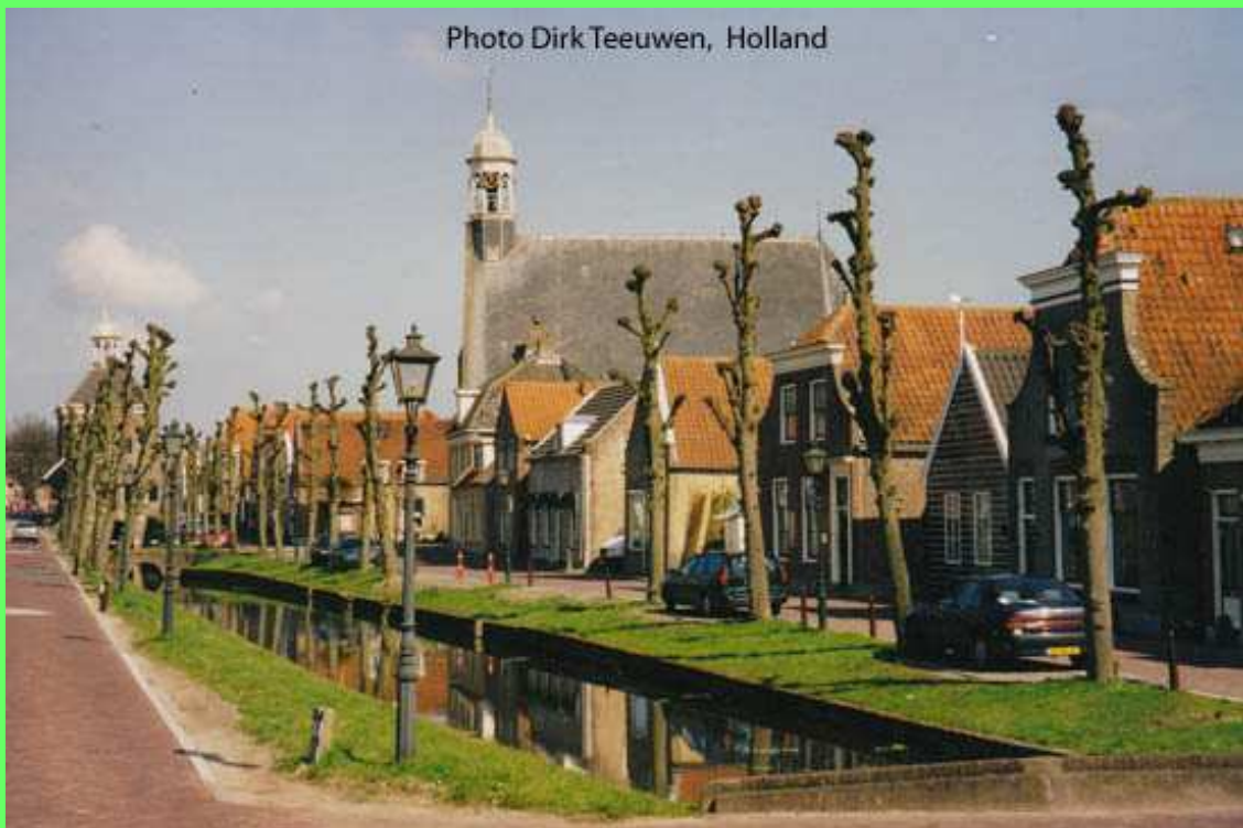
11. The old Inner Harbour, east, in the center the 13 th -18 th century protestant church; Nieuwpoort Holland circa 1955