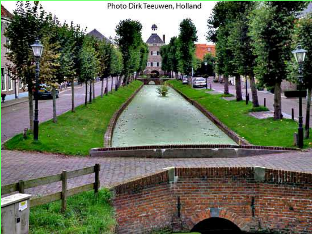
18. The Inner Harbour again, Nieuwpoort Holland 2015 Dirk Teeuwen, Holland