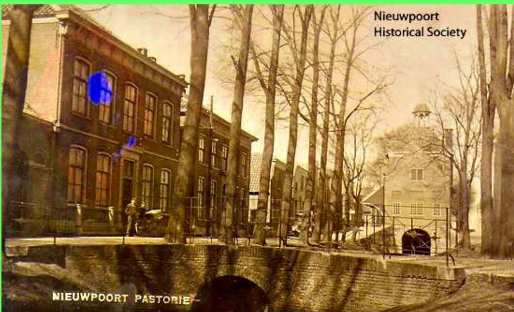
10. The old Inner Harbour, north-west, left from us the old protestant parsonage (rectory); Nieuwpoort Holland circa 1920