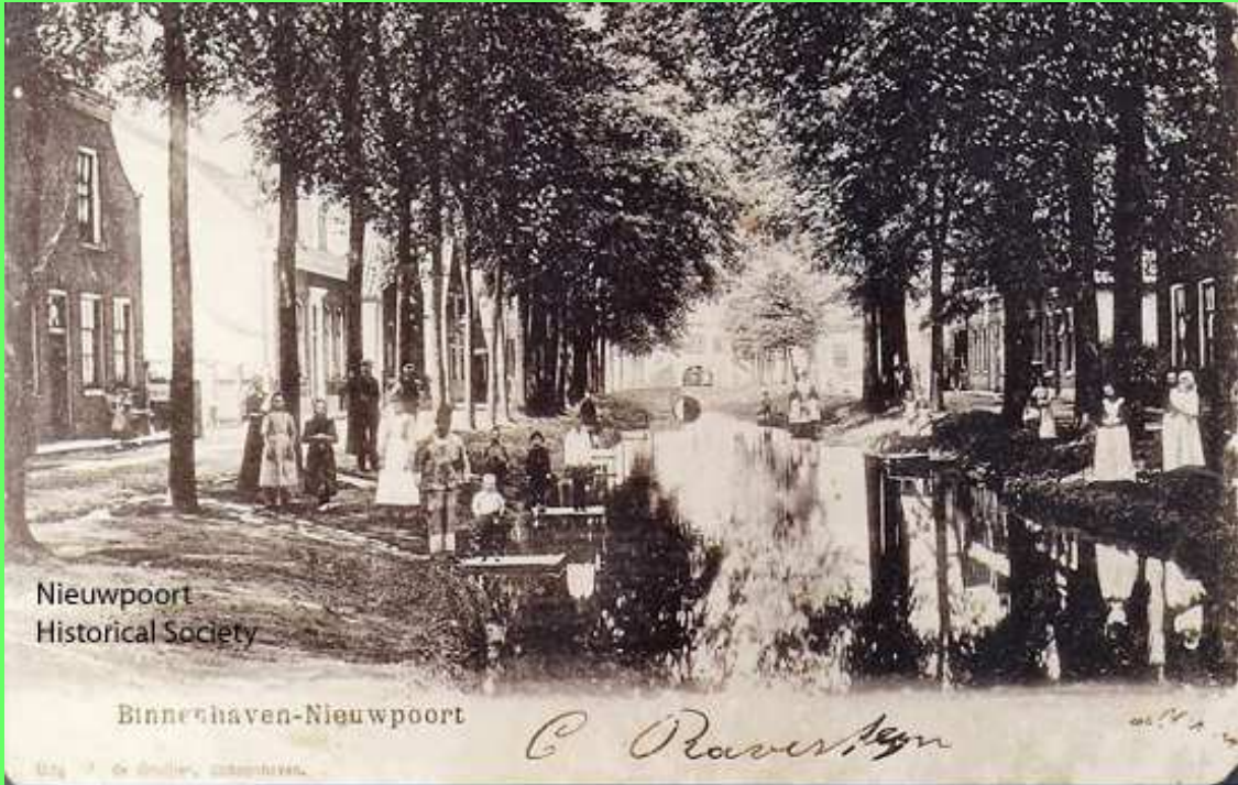
16. The Inner Harbour circa 1900, By courtesy of the "Nieuwpoort Historical Society" Dirk Teeuwen, Holland