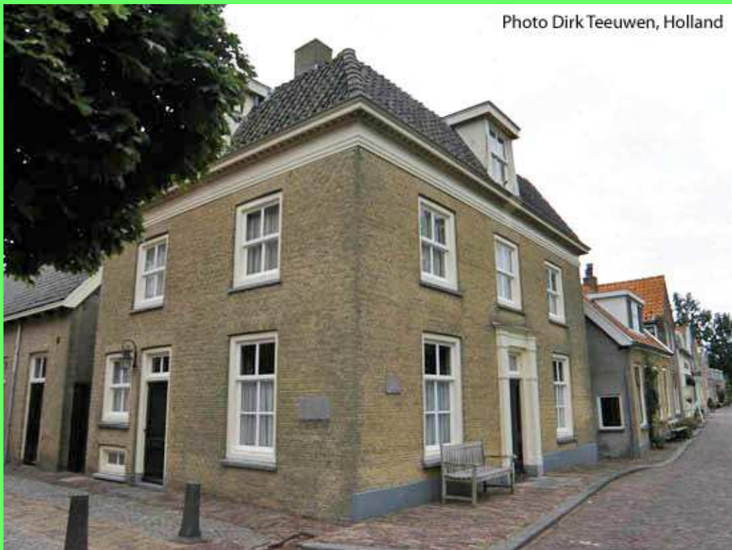
14. The headmaster's house, 19th century; Nieuwpoort Holland 2015 On picture 11: right from the church!