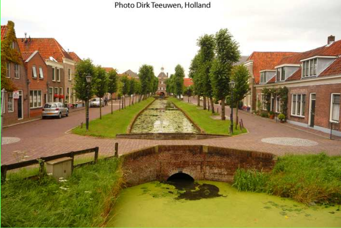
2. The old Inner Harbour; Nieuwpoort Holland 2012 At the end, in the center of this picture, the 17 th century Town Hall.