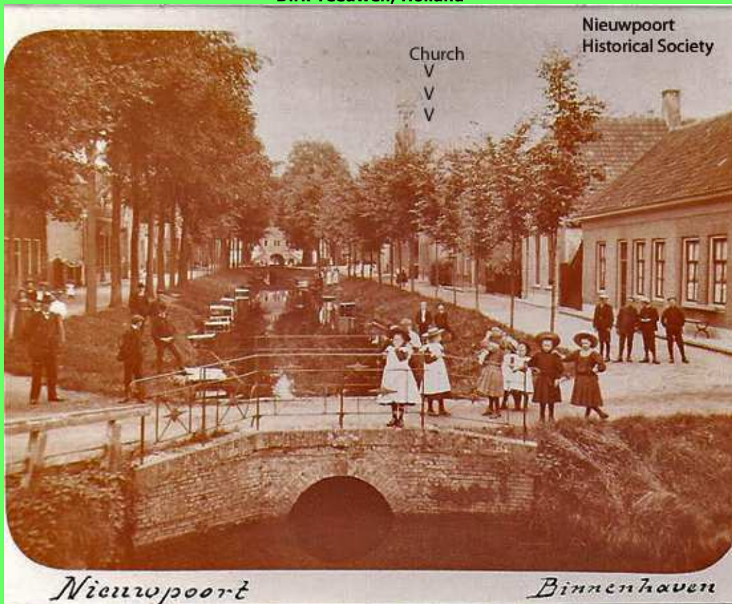
17. The Inner Harbour circa 1910