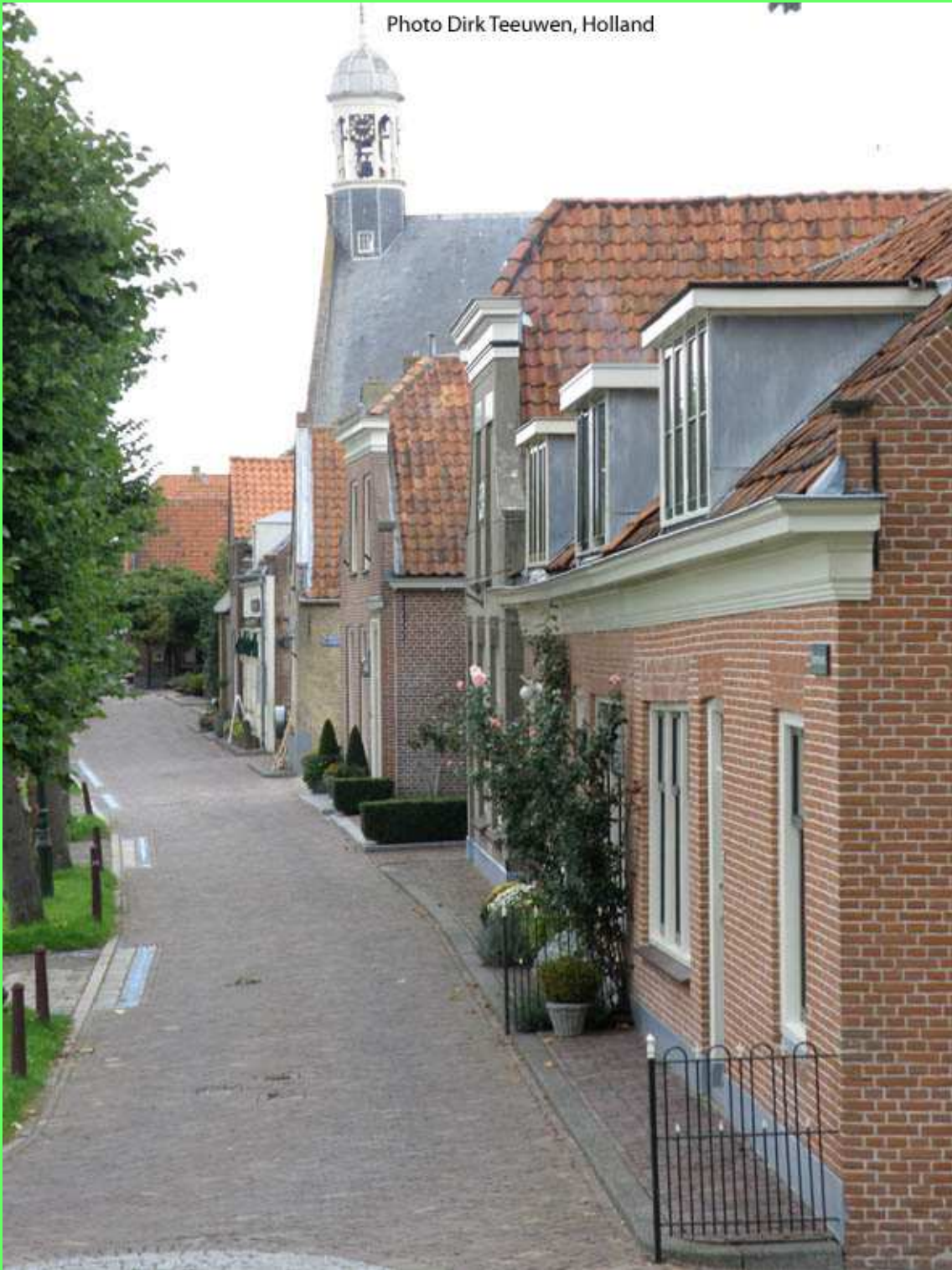
20. See picture 14: times did not change so much! The old Inner Harbour; Nieuwpoort Holland 2012