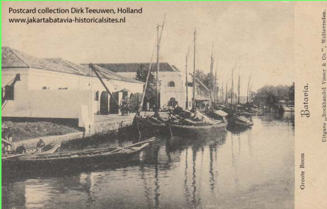
1. and 2. Old customs house, circa 1900