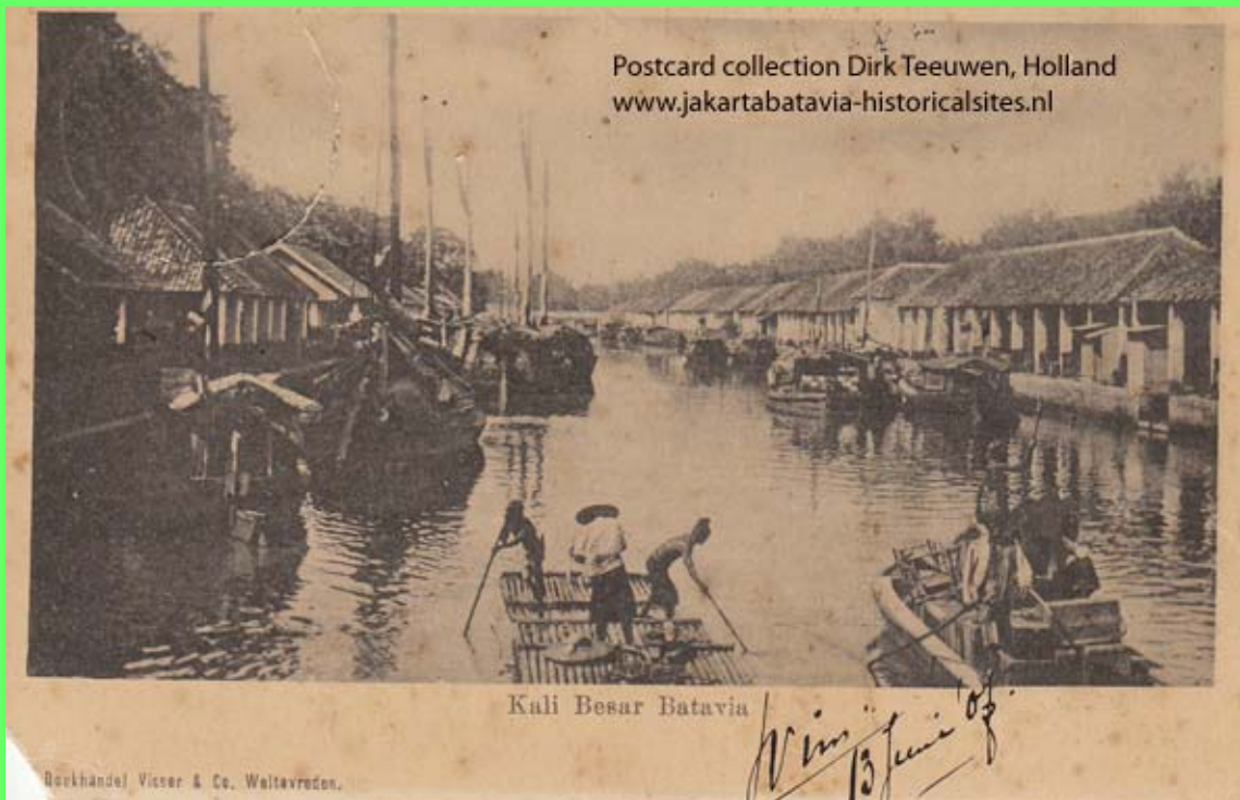
6. Kali Besar to the south, 1907