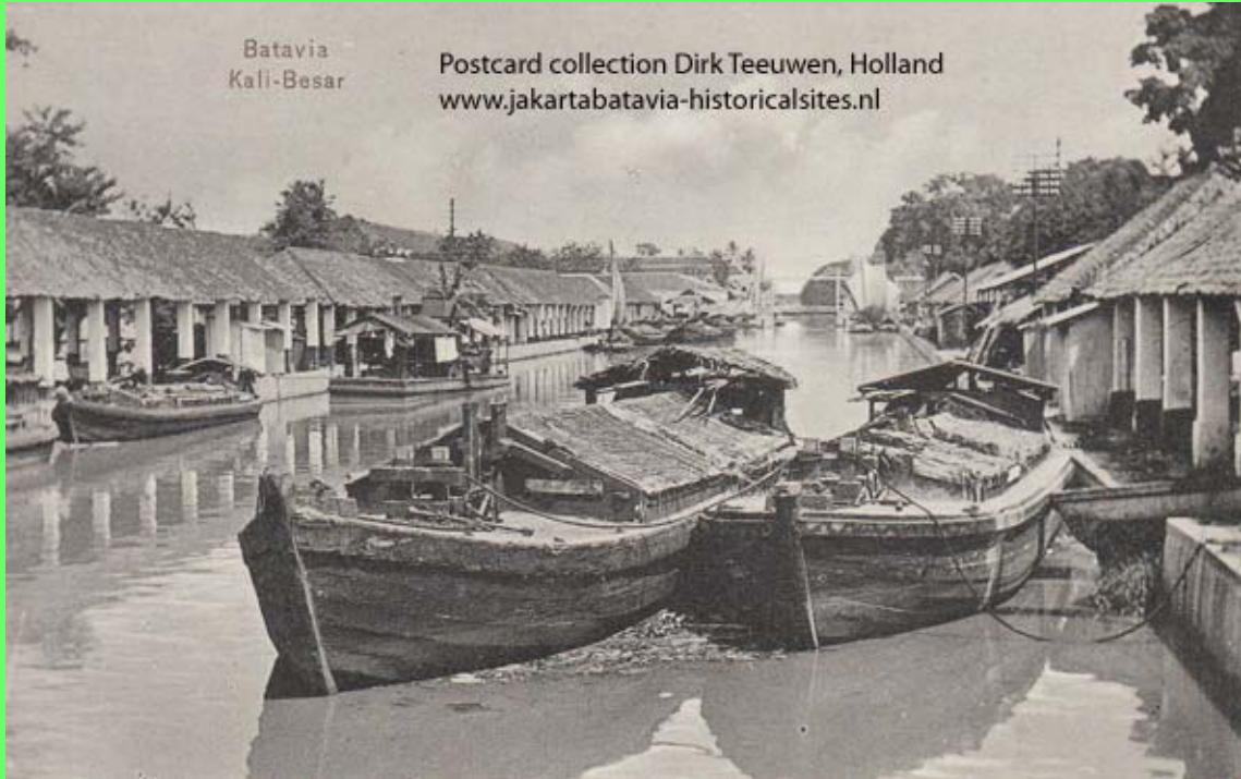
5. See 4.