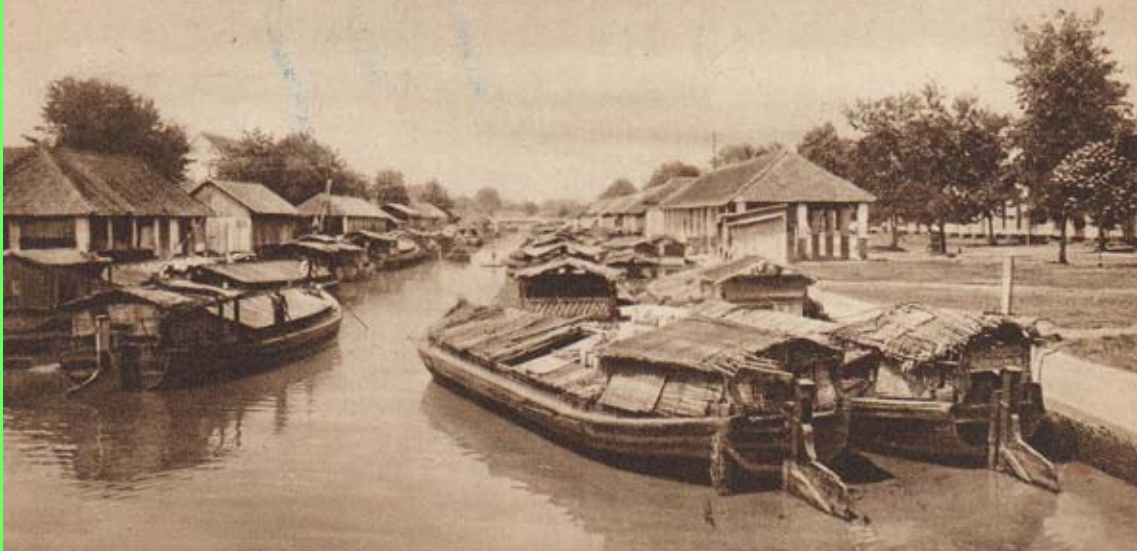
Batavia - Kali Besar