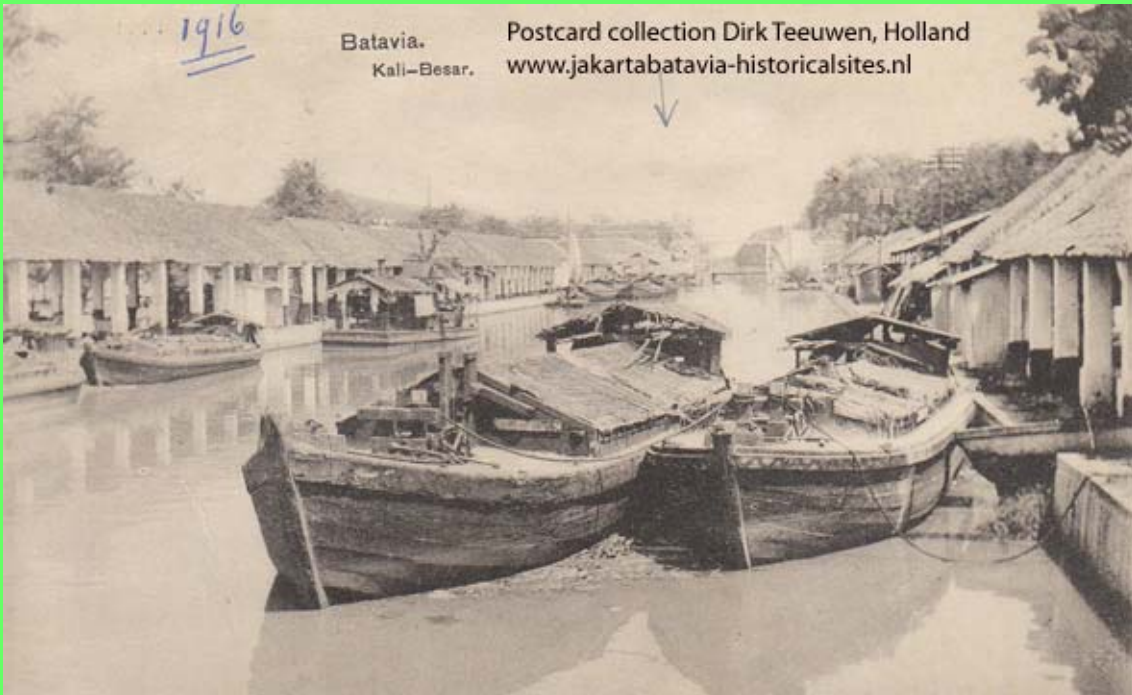
4. Kali Besar to the north, 1916