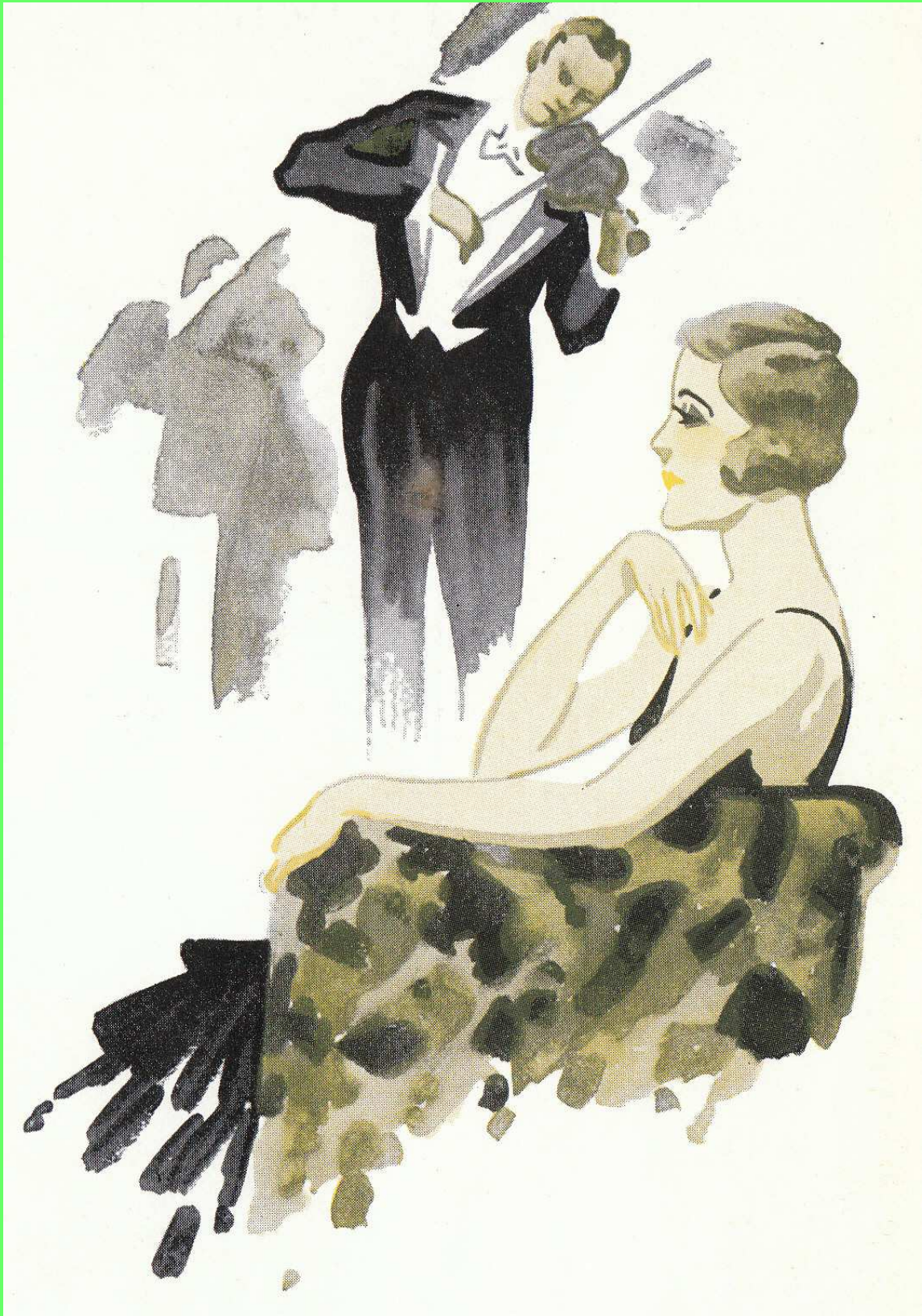
From the twenties