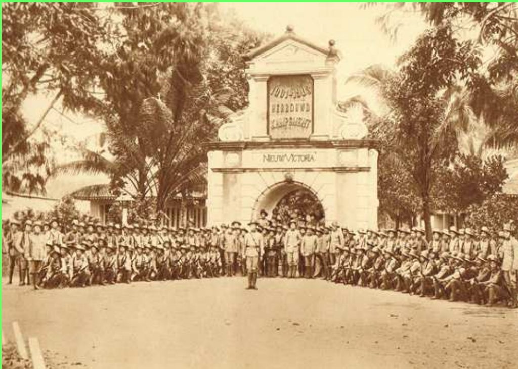
Ambon, 1925