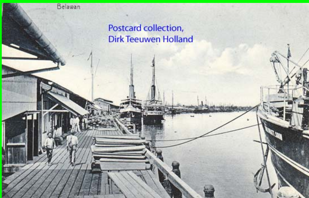
Belawan Harbour, Sumatra circa 1920