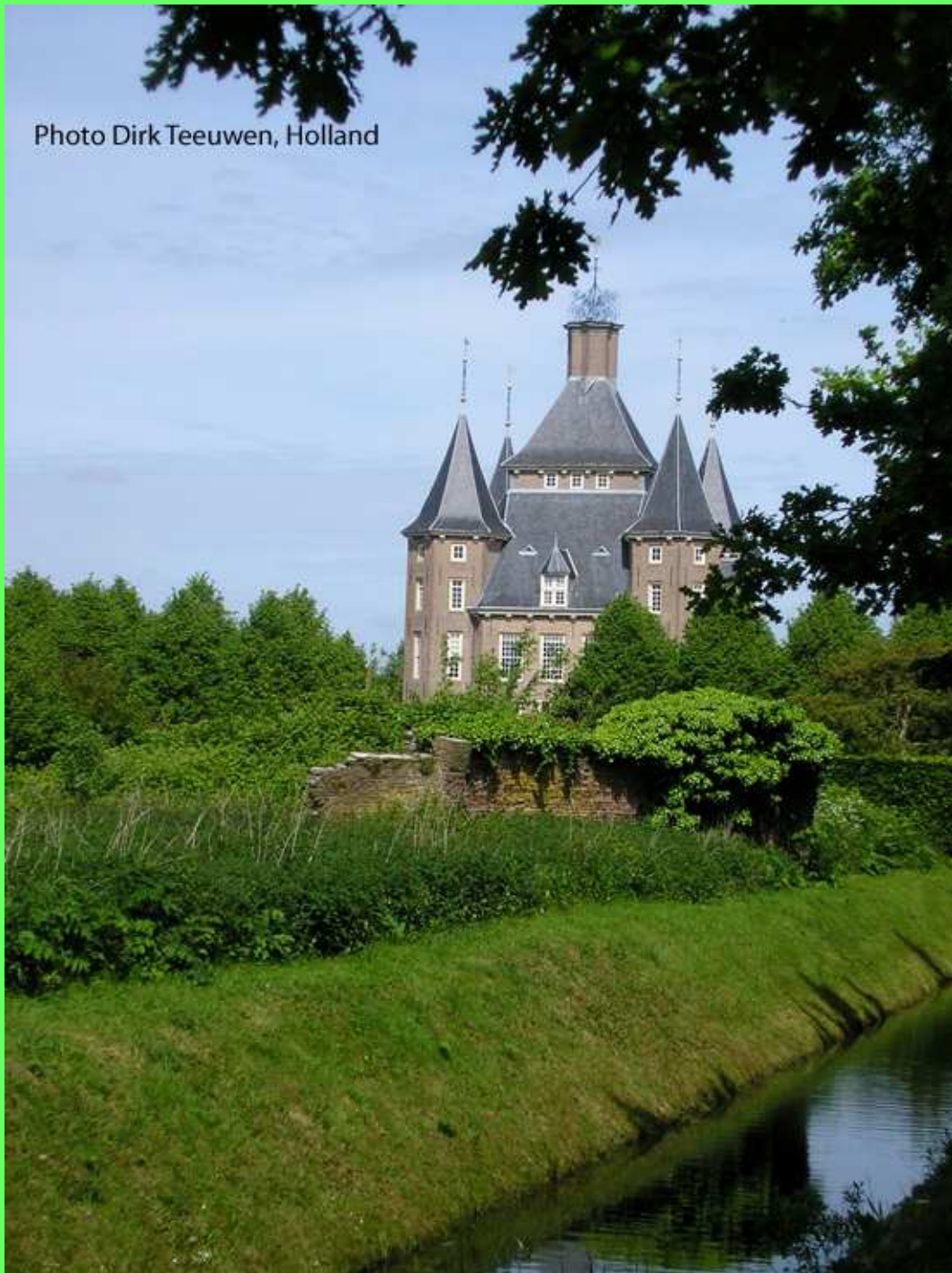
Dirk Teeuwen, Holland