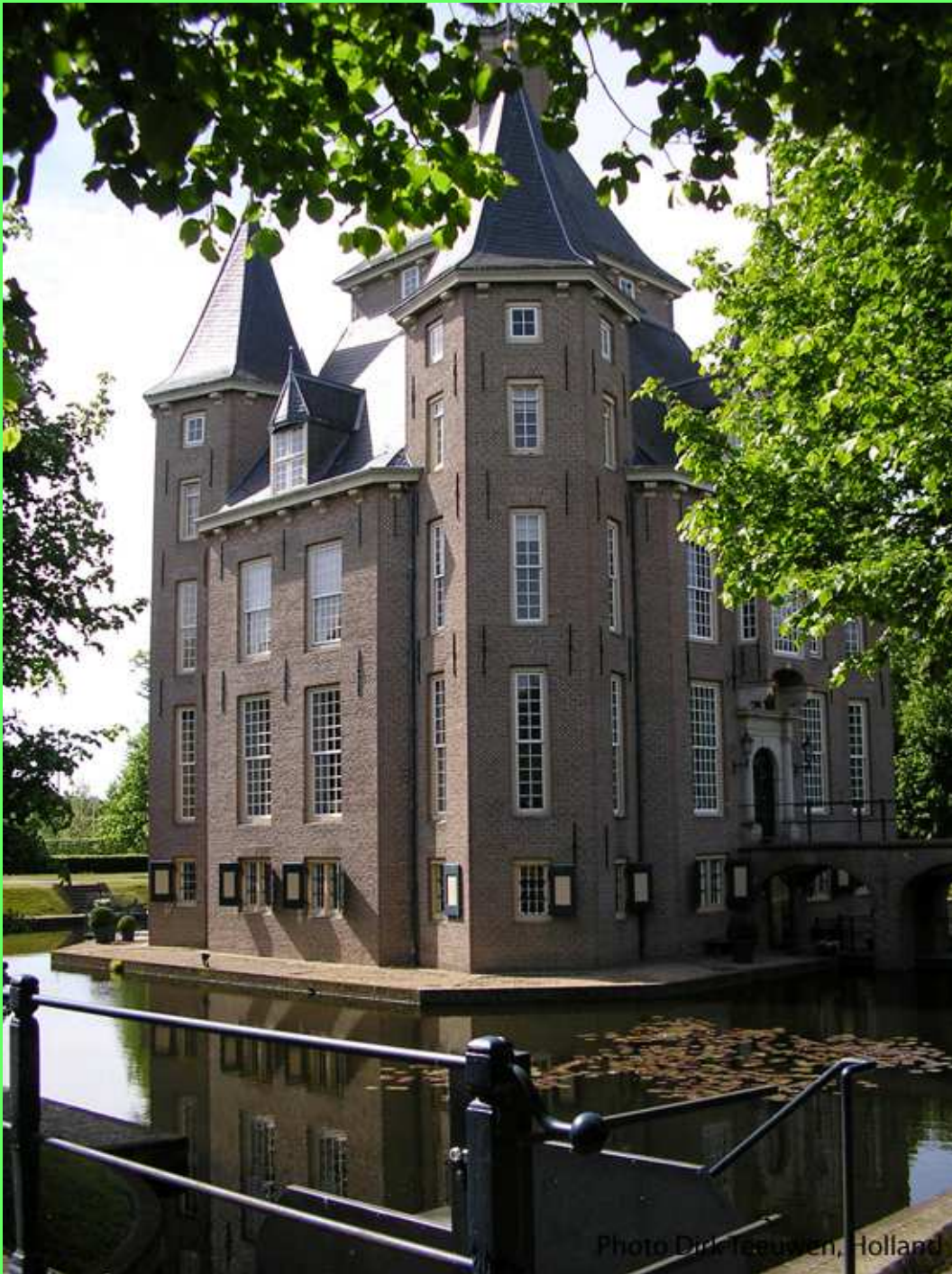
Heemstede Castle, 2015