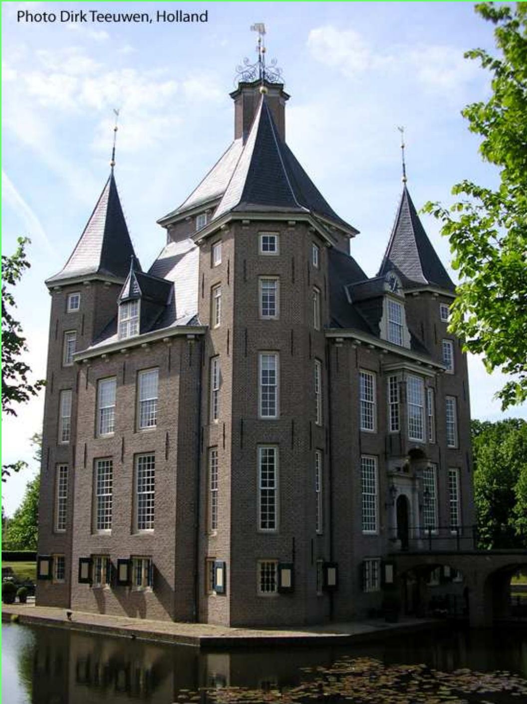
Heemstede Castle, 2015 Main entrance