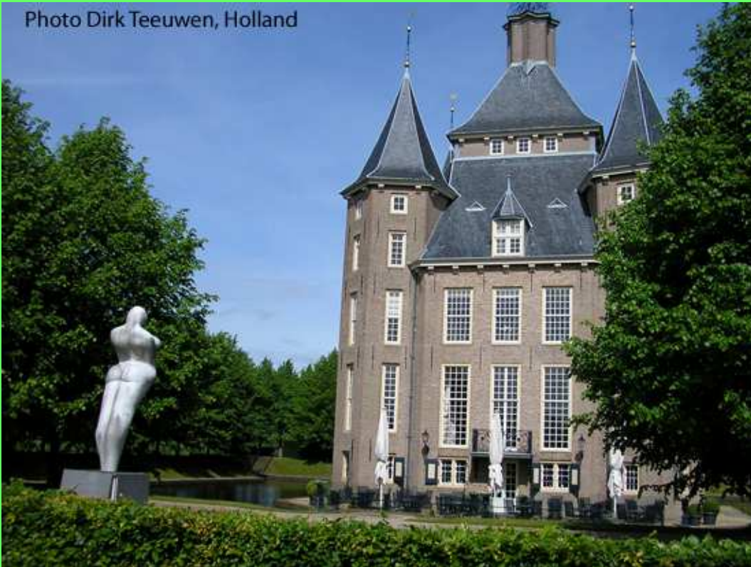
Southern front, 2015