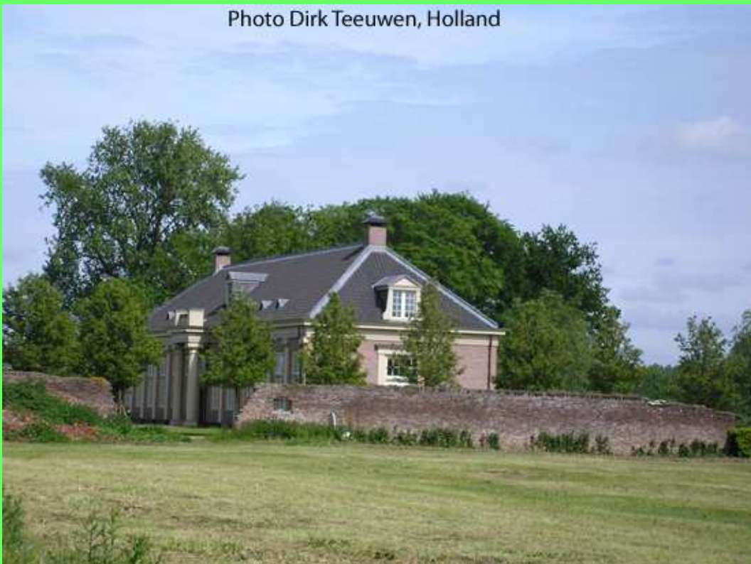
Coach houses, detail; 2015