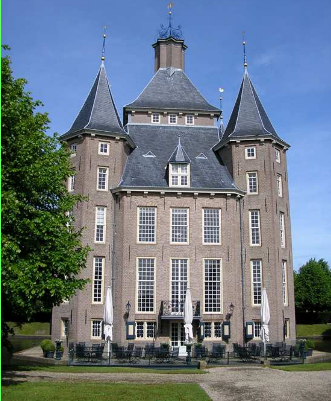
Heemstede Castle, 2015 Southern front