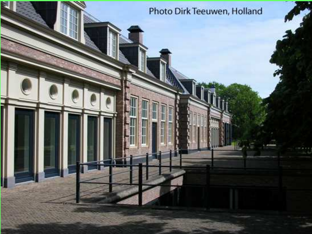
Coach houses, 2015