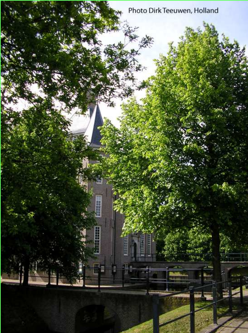
Heemstede Castle, 2015