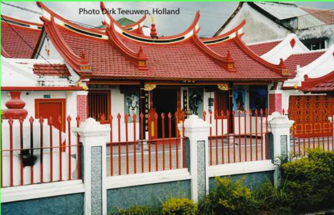
Klenteng (temple) Ling Gwan Kiong, built 1873 Some remains are from the 13 th century.